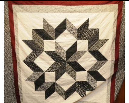
"Carpenter's Star" quilting pattern example.

You may enroll Tuesday, March 23 at the class or in advance at the NOC registrar's office. The cost for this course is $40.00 plus materials. If you have any questions, call the registrar's office at 580.628.6224.