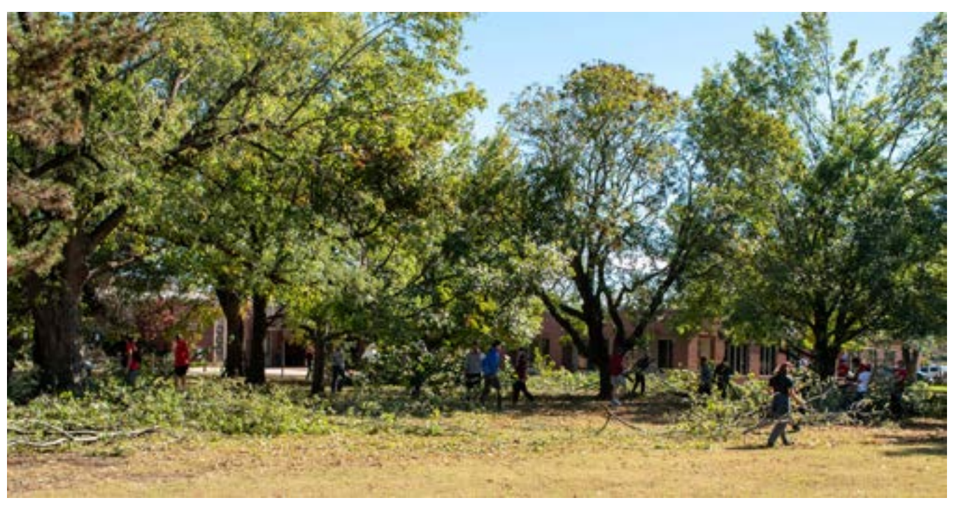
NOC Maverick baseball players clean up tree limbs after ice storm hits. NOC Tonkawa was without power for Tuesday and Wednesday. Classes were cancelled due to lack of power.