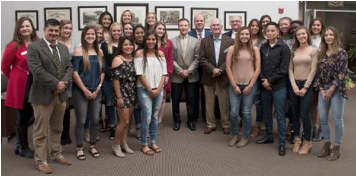
The Women's Soccer Team was recognized at the NOC Board of Regents Meeting Tuesday for an Academic Award received for 2016-17. The team had a cumulative 3.56 GPA while only 13 teams across the nation maintained a 3.00 GPA. The women's team is in the Region II Playoffs this weekend at NEO in Miami.