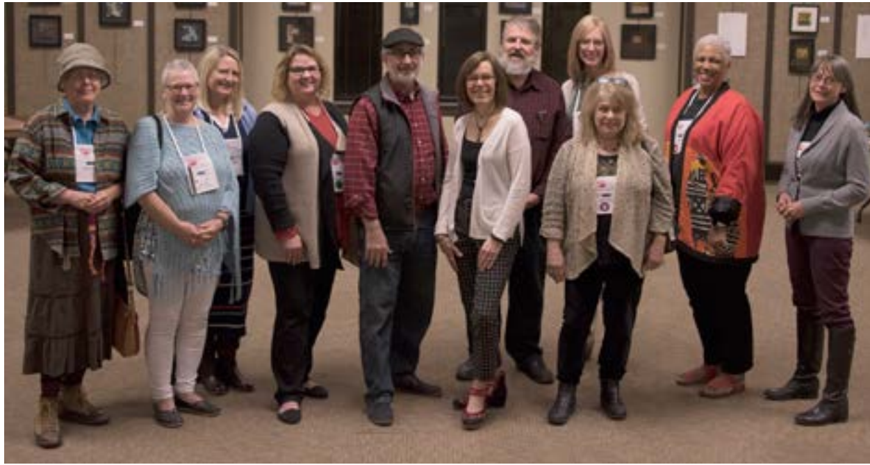
NOC artists joined Enid area art lovers for the CREATORS 2017 Art and Literature Exhibition Reception Wednesday at the Marshall Building in Enid.