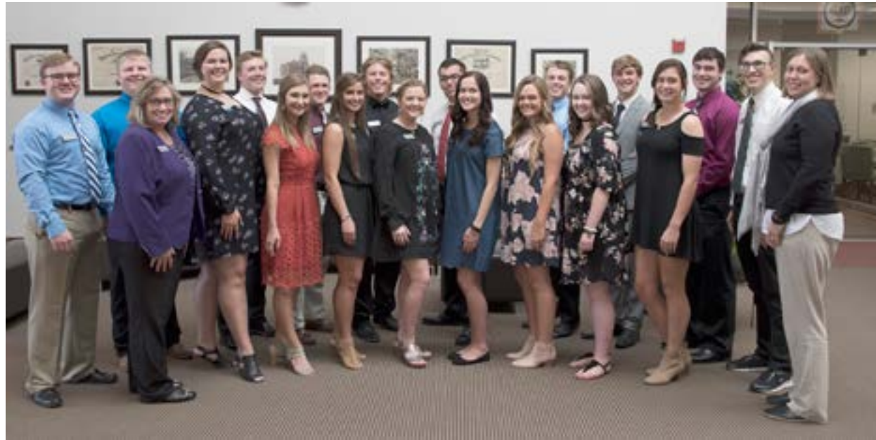
PLC Students at the NOC Tonkawa were recognized at the October NOC Board of Regents Meeting Tuesday at Tonkawa. The Regents viewed a slide show of the PLC's trip to Washington, D.C. over Fall Break.