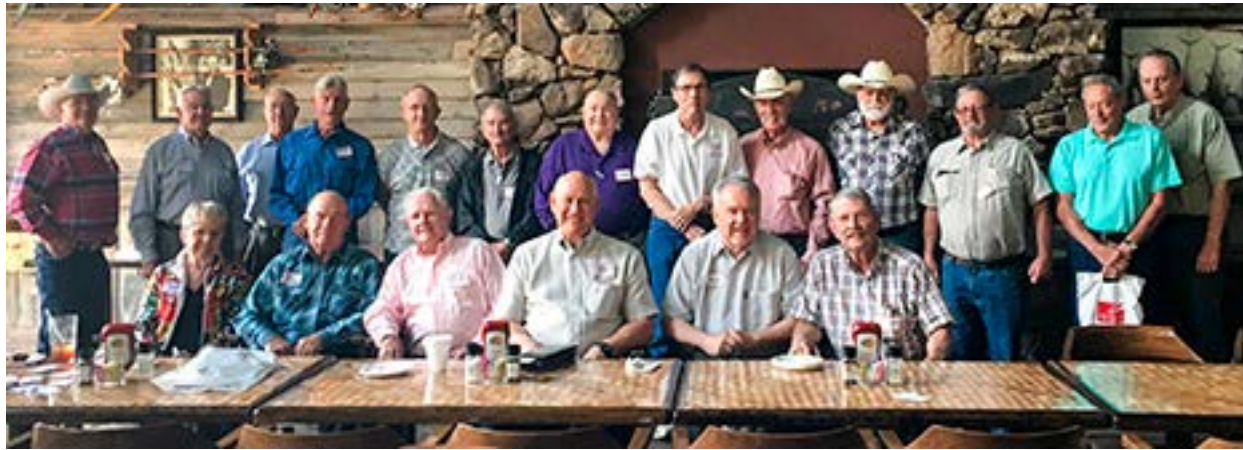
Thirty NOC athletic alumni attended a reunion luncheon Oct. 20.