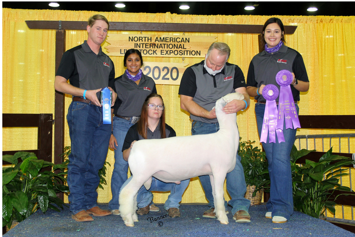
The NOC Sheep Center exhibited the Champion Dorset Ram at the NAILE Show in Louisville, Kentucky (photo provided)