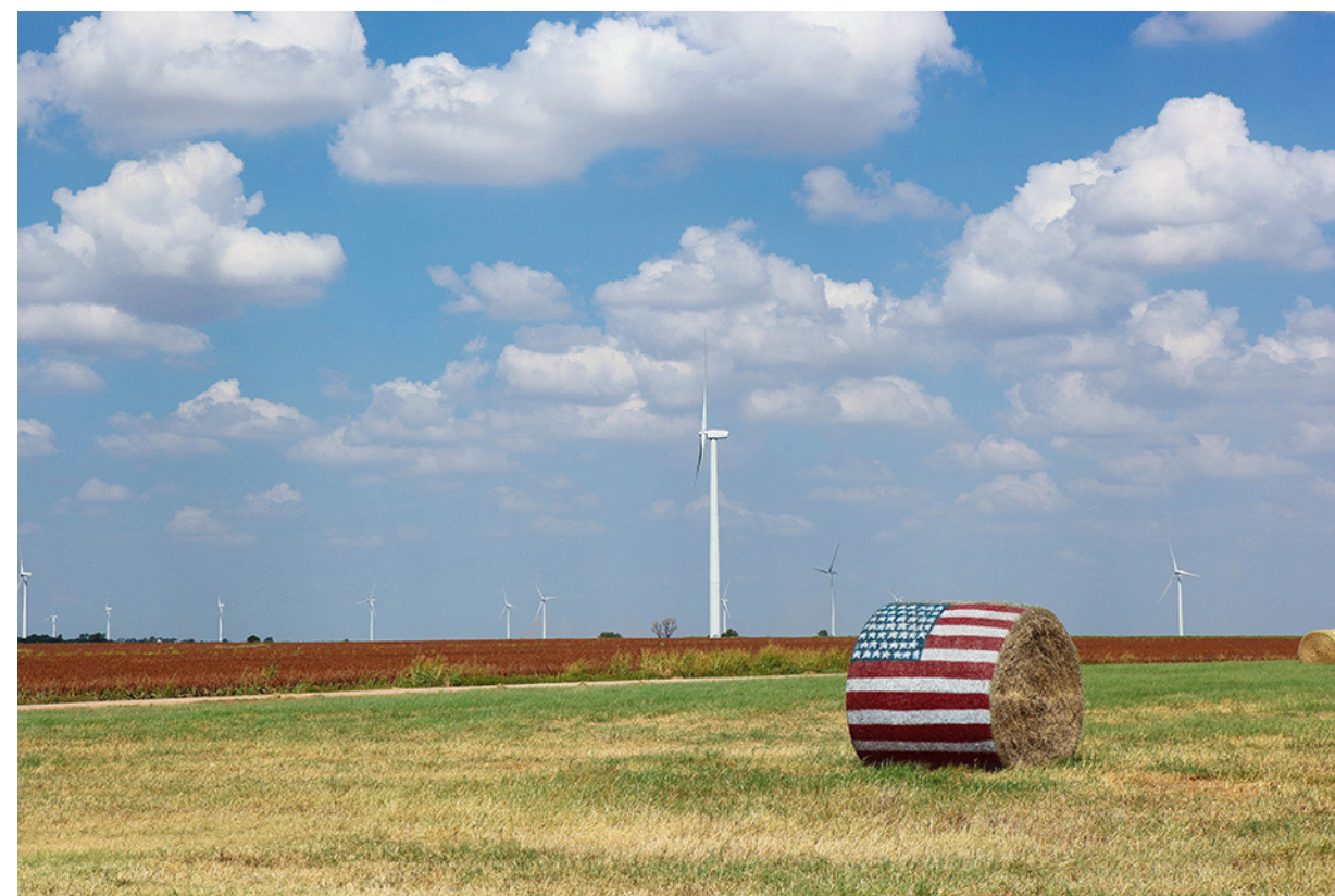
NOC is partnering with Enel Green Power for a new Wind Technician Program and scholarship program. Pictured is a view of the Chisholm View Wind Farm