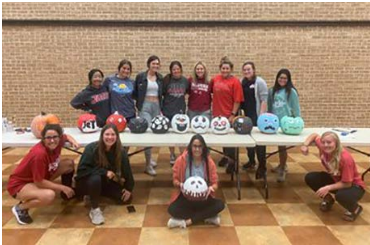
NOC Enid Resident Life sponsored a Pumpkin Paint Night at Montgomery Hall on Thursday night.