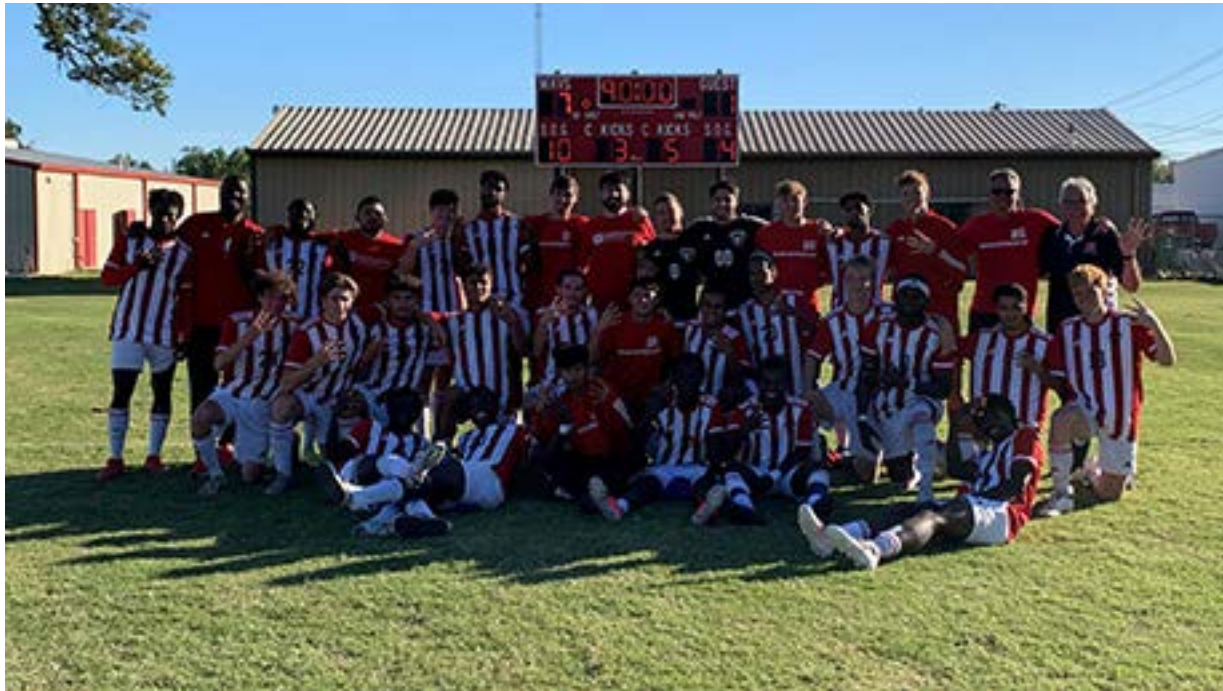
NOC Men's Soccer repeats as regular season conference champions for Region 2. The Mavs' playoff run begins Friday at Enid High School at 9 a.m.