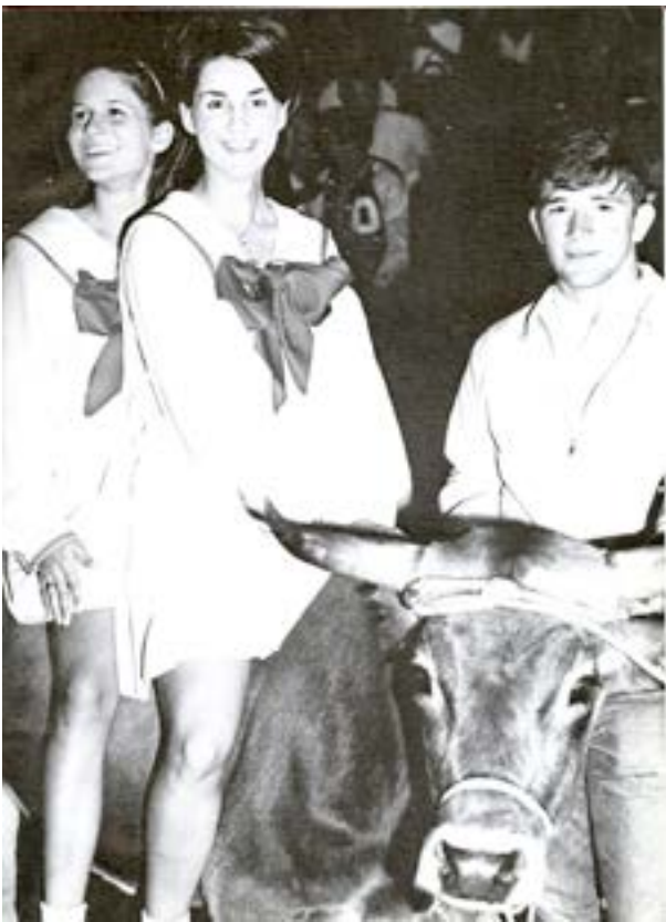
A photo in the 1967 NOC Yearbook of the mascot “Malcolm the Mav.”

Another photo of a live mascot is from the 1967 Yearbook.