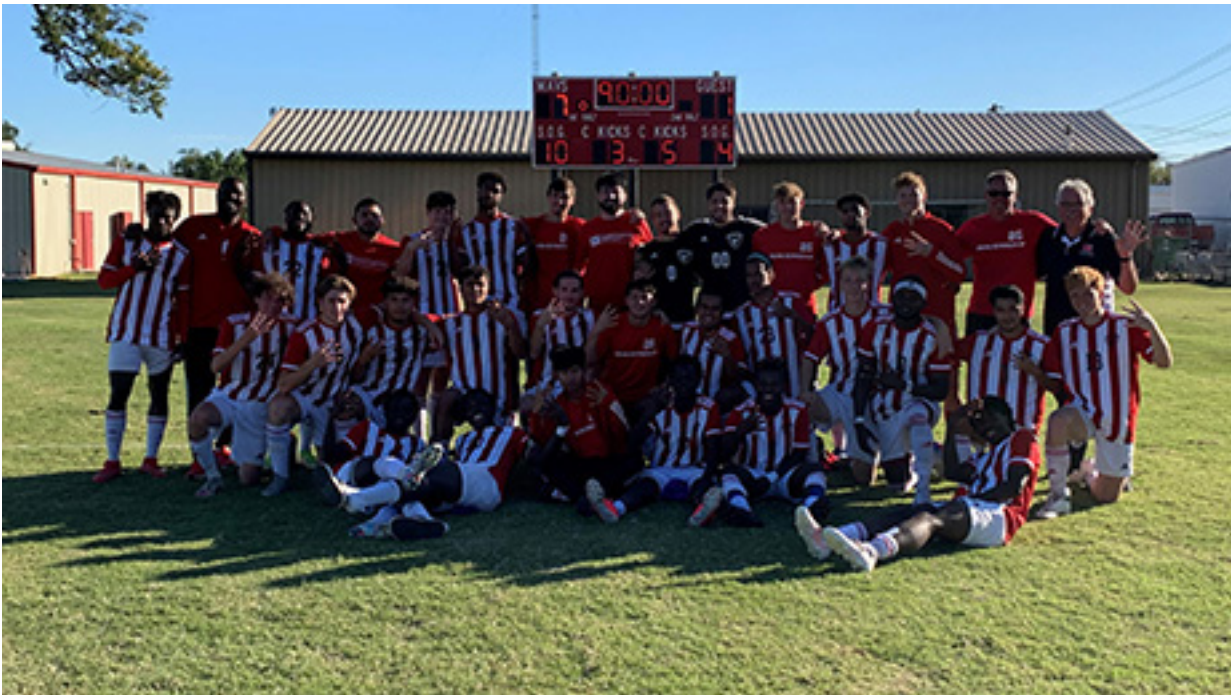
NOC Men's Soccer repeats as regular season conference champions for Region 2. The Mavs' playoff run begins Friday at Enid High School at 9 a.m.