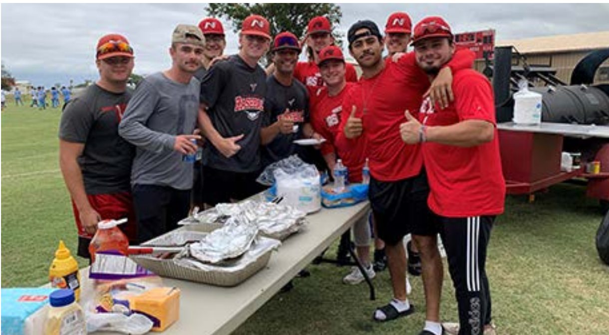
Mavs Baseball attended a Maverick Magic Club Cookout Thursday for NOC students at the NOC Soccer Field.