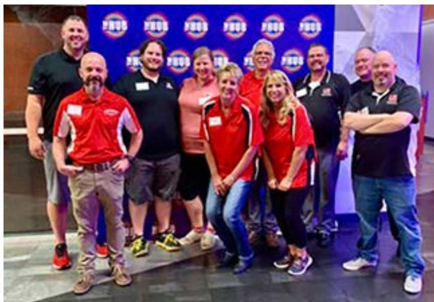
NOC faculty and staff participated in a Bowling Tournament Fund Raiser for the Tonkawa Development Authority last Tuesday night at The Hub in Tonkawa.