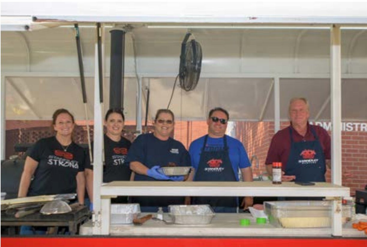
Standley Systems provided lunch at NOC Stillwater and NOC Tonkawa this week for NOC employee appreciation. Lunch will be provided at NOC Enid for employees Nov. 16.