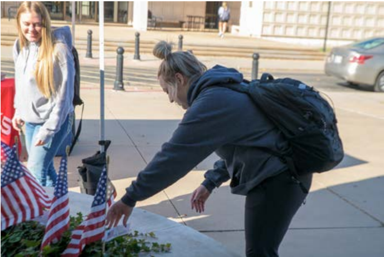
NOC Tonkawa students planted flags in the Clocktower flower bed in honor of veteran's in their individual lives.