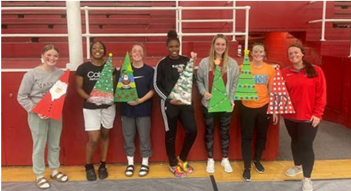
NOC Tonkawa students enjoyed a Paint Night sponsored by NOC Tonkawa Resident Life.