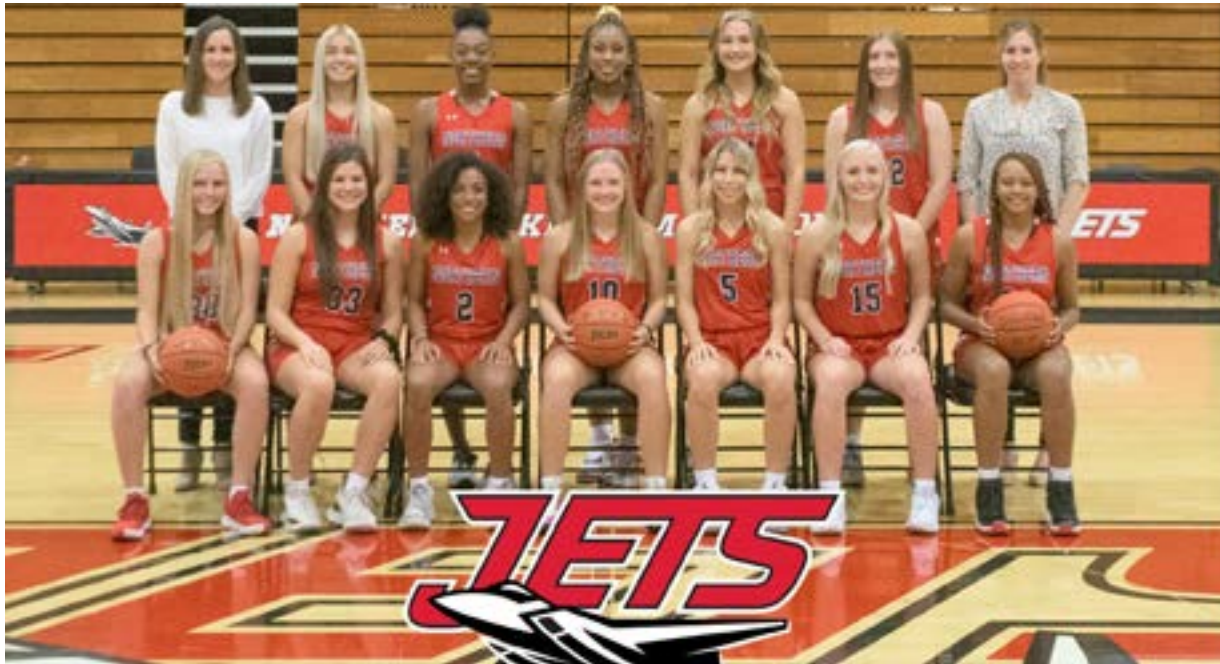
The NOC Enid Lady Jets 2021-22