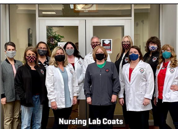
Nursing Lab Coats