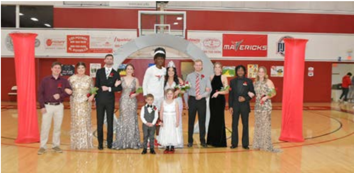
The 2022 NOC Tonkawa Homecoming Court