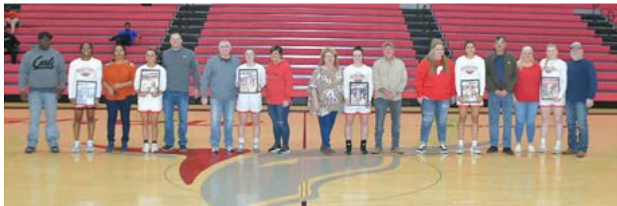
Lady Mavs Basketball Sophomore and Parents