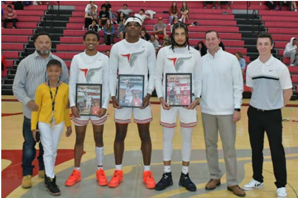
NOC Mavs Basketball Sophomores and Parents