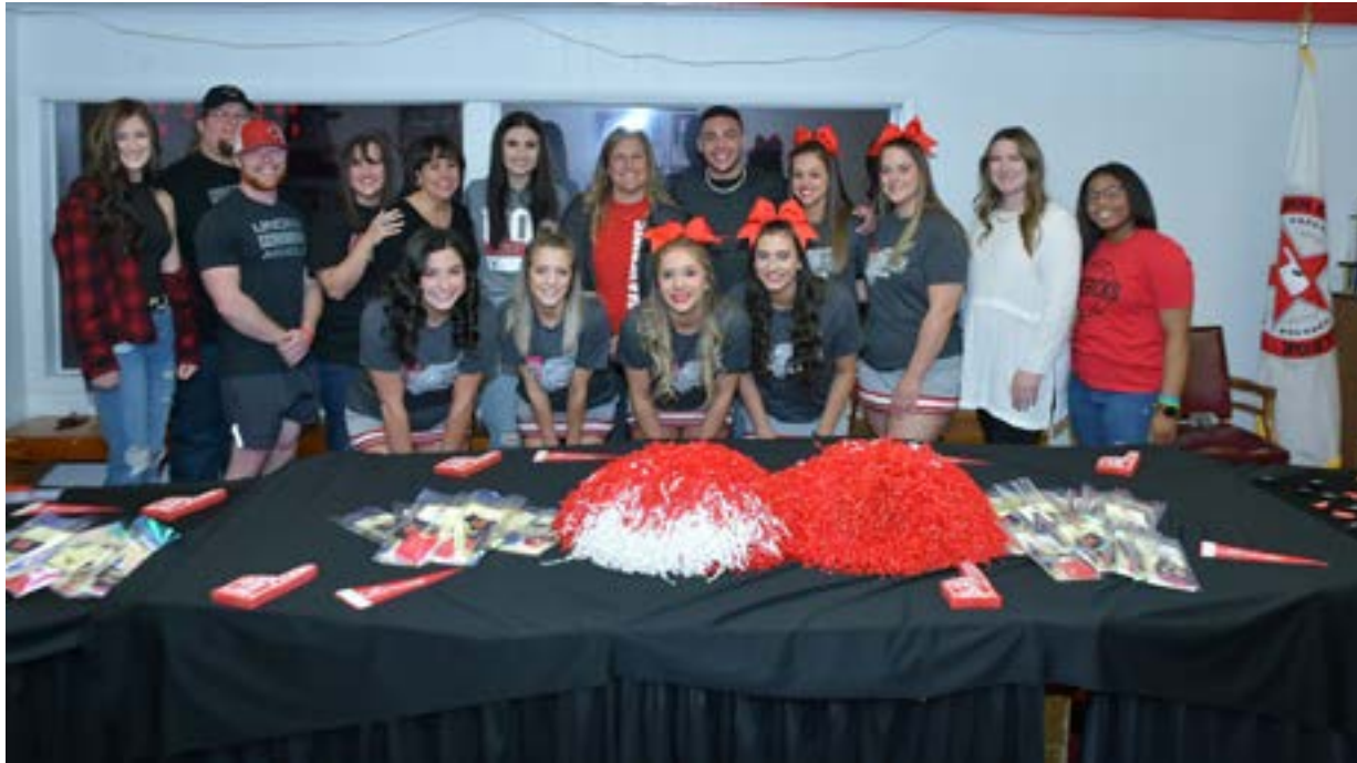
The NOC Maverick Cheerleaders held a cheer reunion Monday night at the Harrison Room in Foster-Piper Fieldhouse.