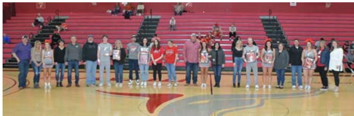
NOC Tonkawa Cheer Sophomore and Parents