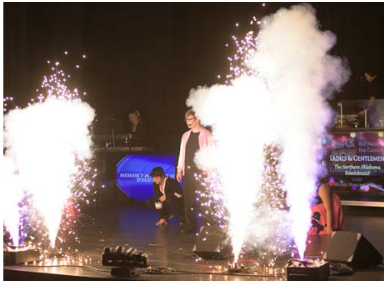
The Northern Oklahoma College Division of Fine Arts presents the Roustabout Benefit Show Saturday, April 2. Showtime is at the Kinzer Performing Arts Center at 7:30 p.m. Tickets are $10 for adults and $7 for students.

The Top 10 list includes the following: 1. The University of Oklahoma. 2. Oklahoma State University-Oklahoma City. 3. University of Tulsa. 4. Oklahoma City University. 5. Oral Roberts University. 6. East Central University. 7. Northern Oklahoma College. 8. Oklahoma Baptist University. 9. Oklahoma Christian University. 10. Southwestern Oklahoma State University.