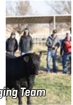
With Northern's Award-Winning Livestock Judging Team