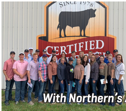
With Northern's Award-Winning Livestock Judging Team