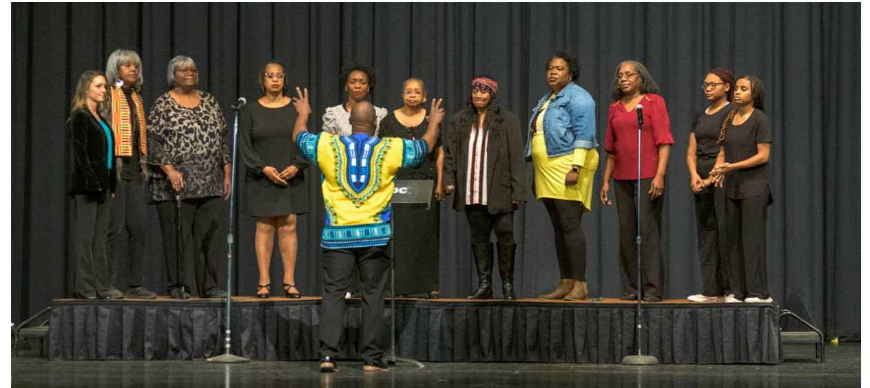
Enid Community Choir

The event was streamed and is available at www.noc.edu .