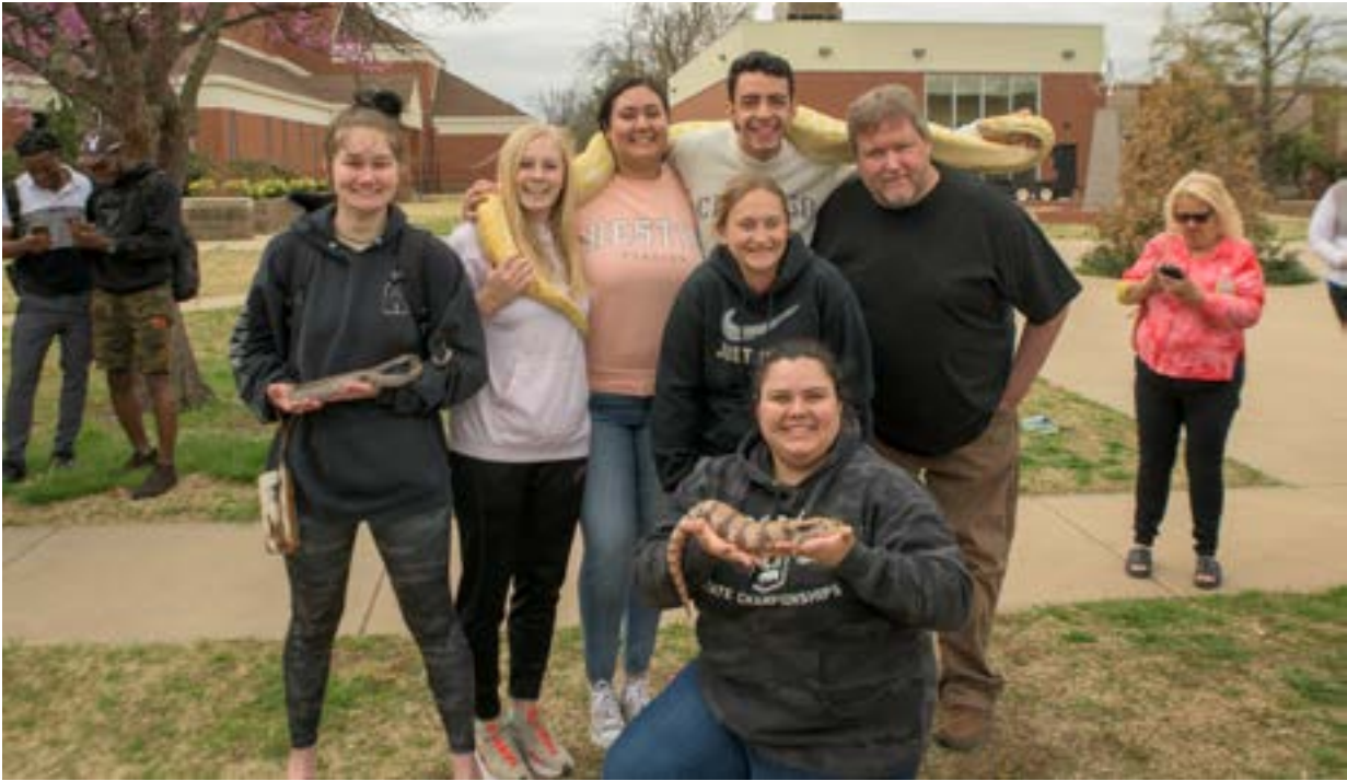
Exotic Animals Zoo