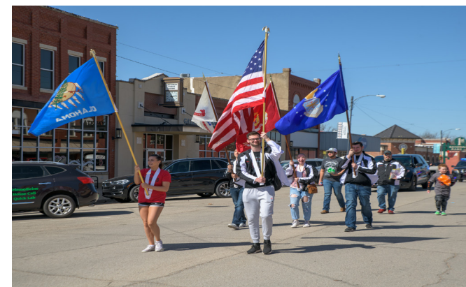
NOC Tonkawa's Criminal Justice Society carried the flags in the Tonkawa Film Festival Parade on Saturday, April 8.