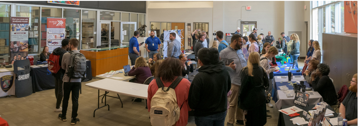
NOC Tonkawa hosted a Job Fair Wednesday morning where students could interact with representatives from 15 area vendors.

It is okay if some of these study habits do not work for you. Find out which ones do work and ask your peers what study habits they have to add to yours.