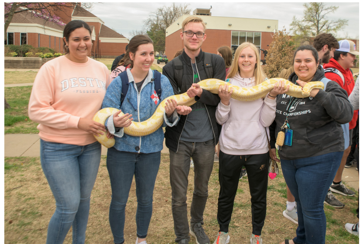
Students enjoyed the Exotic Pet Student Activity last week at the Gazebo

The extreme petting zoo was a hit on the Tonkawa campus and gave the students of NOC a fun and memorable experience.