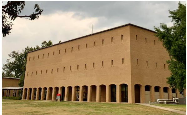
Zollars Memorial Library