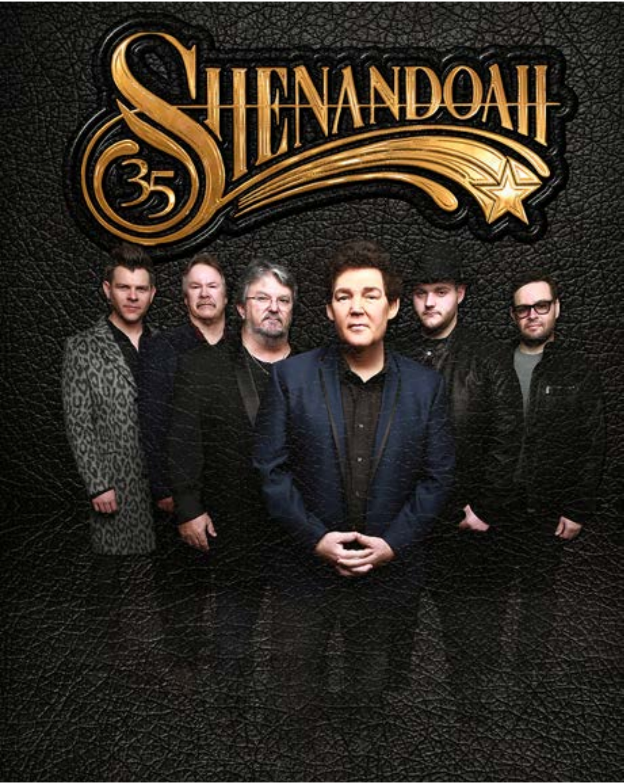
Shenandoah will appear at Northern Oklahoma College Thursday, Sept. 29 for the Renfro Endowed Lectureship Series fall event at the Kinzer Performing Arts Center.

Call the Northern Oklahoma College Development Office at 580.628.6214 for additional information.