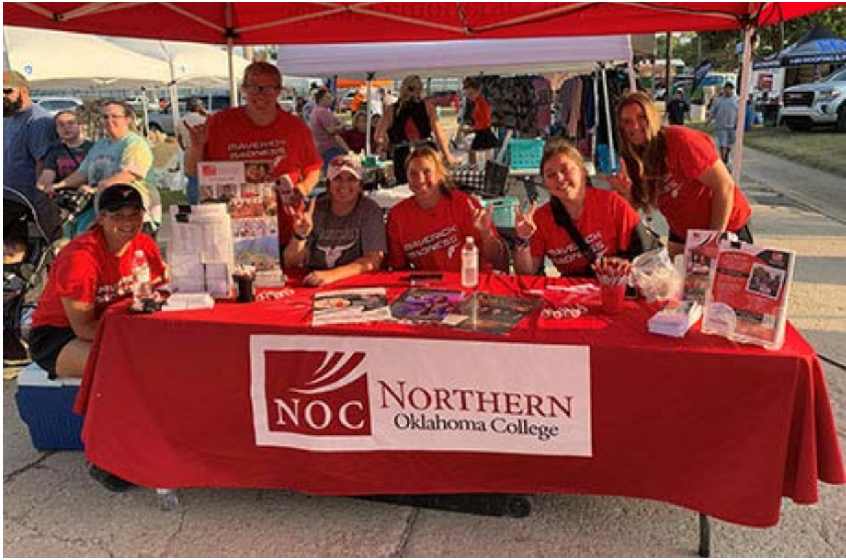
NOC Mays Softball at the Kay County Fair Thursday night. The fair concludes Sunday, NOC will have a booth at the fair all weekend.