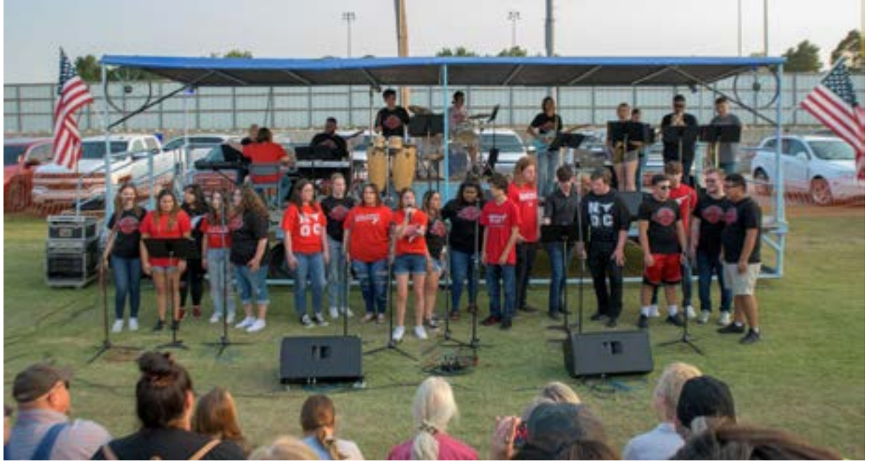
NOC Roustabouts at the Kay County Fair Tuesday evening in Blackwell.