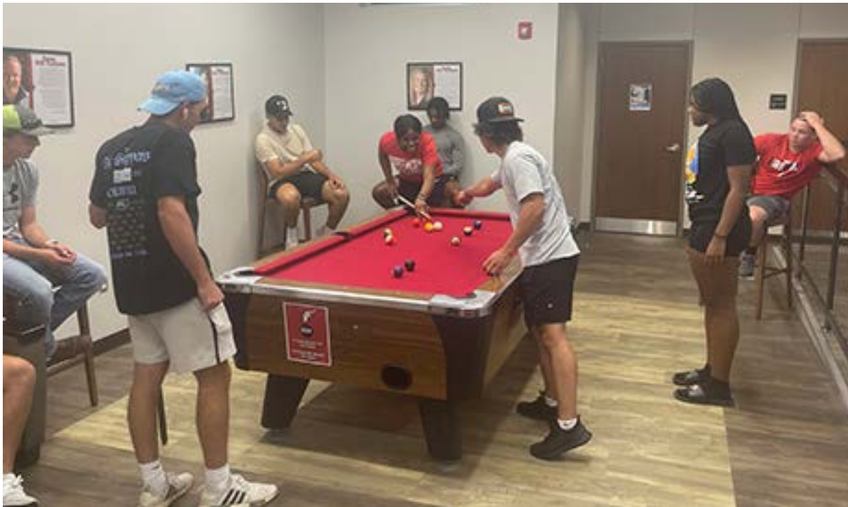
NOC Tonkawa Resident Life held a pool tournament in the Memorial Student Union Tuesday night.