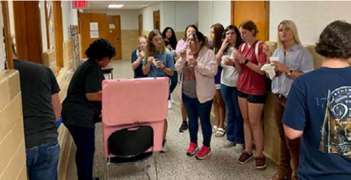
The NOC Enid STEM Ambassadors Club met Thursday for their first meeting of the school year with free ice cream for students.