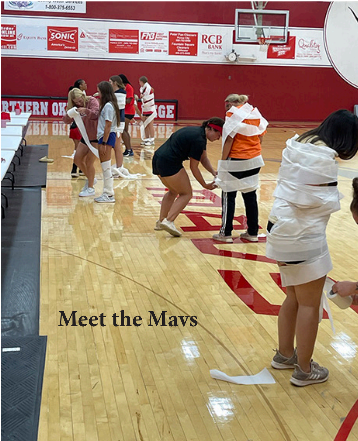
Meet the Mavs