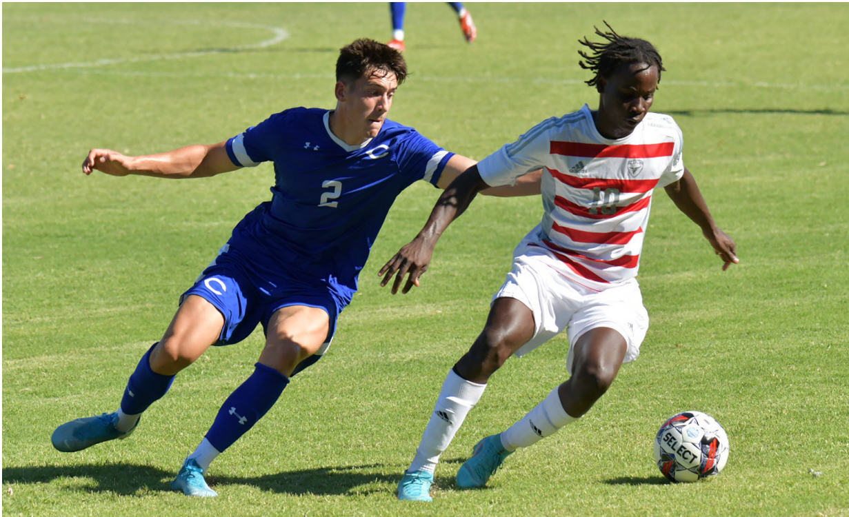
NOC Women’s Soccer is 2-1-1 on the season while the men are 1-3-1. The Mavs host Allen County Wednesday starting at 2 p.m.