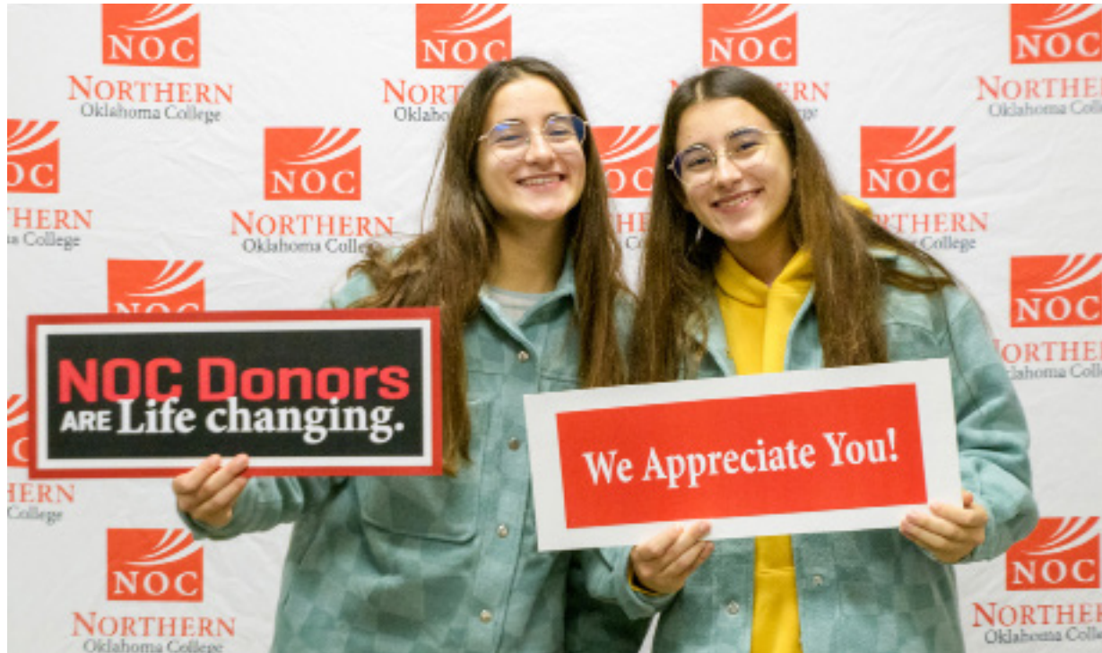
NOC Tonkawa students had an opportunity thank donors for their scholarships at a Thank-A-Thon event Thursday night.