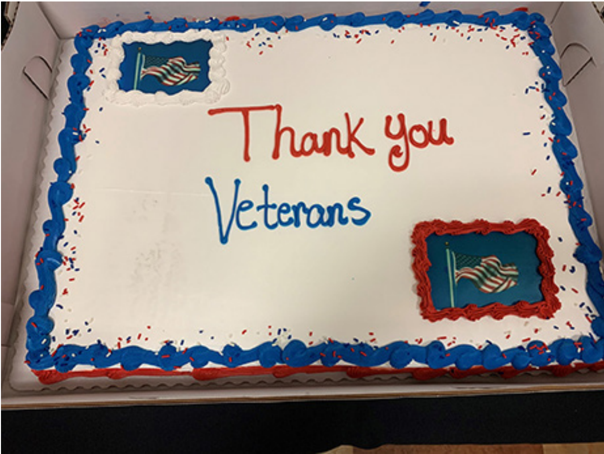
Enid area veterans were honored at NOC Enid on Friday. They were served cake by NOC Enid President's Leadership Council.