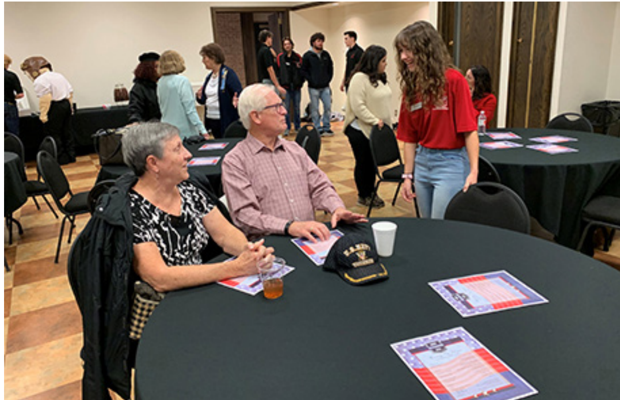
NOC Enid PLC Students hosted a number of Enid area veterans last Friday in a Veterans Day Program organized by the NOC Diversity Committee.