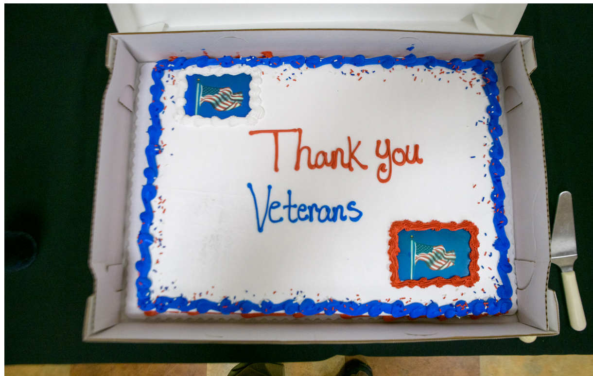
Area veterans were honored with a cake thanking them for the service to our country.