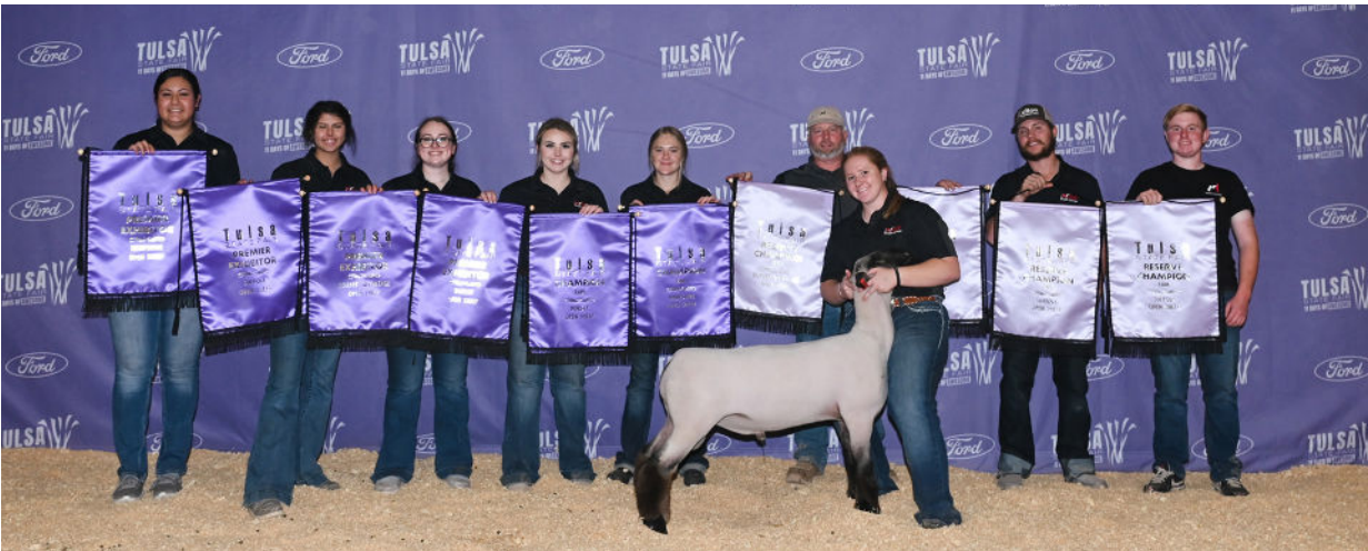
The NOC Sheep Center earned nine awards at the Tulsa State Fair.

ka, and Flint Hills Mid-America Class. The Mavs were high team at the Cimarron Classic, high team at the State Fair of Texas (sophomores), and fifth high team (freshmen). At the Tulsa State Fair, the Mavs sophomores were fifth while at Flint Hills the Mavs sophomores were second and the freshmen fifth high overall.