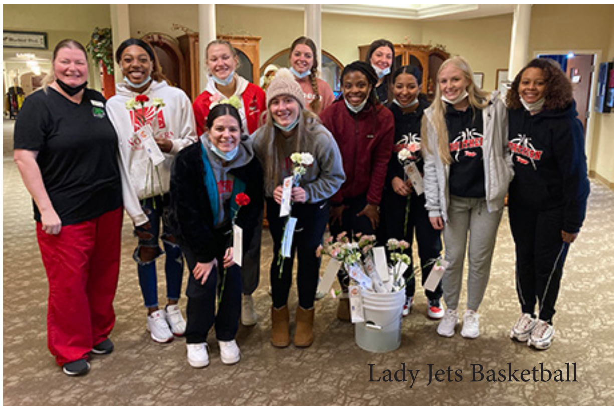
Lady Jets Basketball