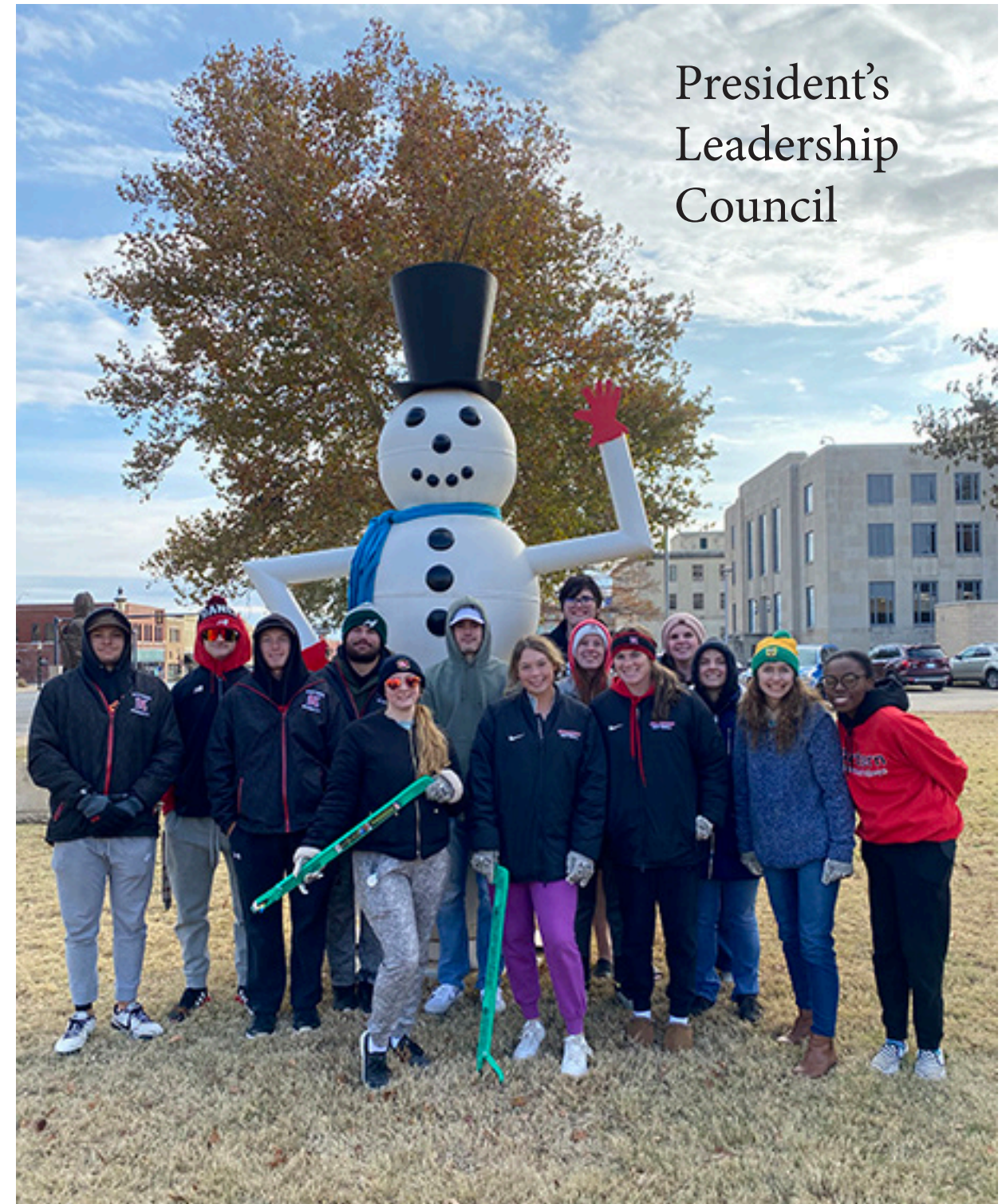
President's Leadership Council