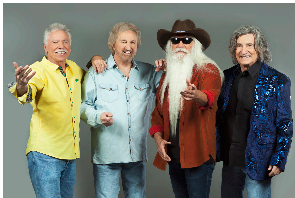
The Oak Ridge Boys are set to appear at Northern Oklahoma College Tonkawa on Feb. 16. On their 2023 Front Porch Singin' Tour. Tickets go on sale Jan. 19.

The Oak Ridge Boys previously appeared at NOC in spring 2019.