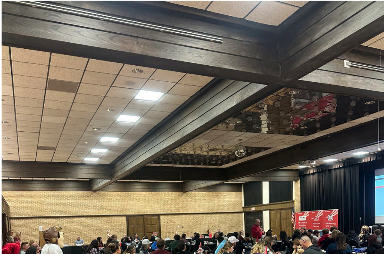
NOC Enid (above) and Stillwater (below) held Northern Encounter programs recently to showcase NOC to prospective students and their parents. (photos provided)