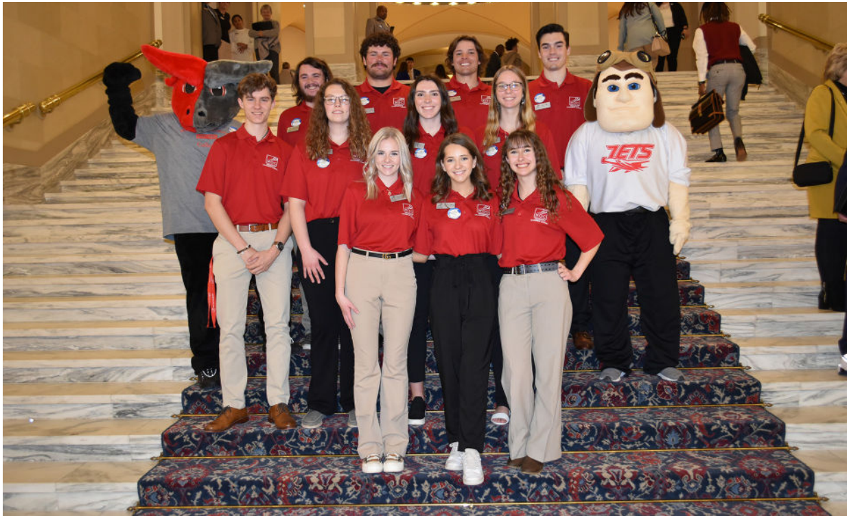
NOC students, faculty, and staff attended Higher Education Day at the State Capitol on Tuesday, Feb. 14.