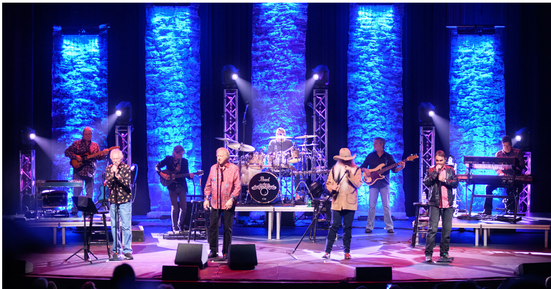
The Oak Ridge Boys appeared at Northern Oklahoma College Thursday night as part of the Carl and Carolyn Renfro Lectureship Program.