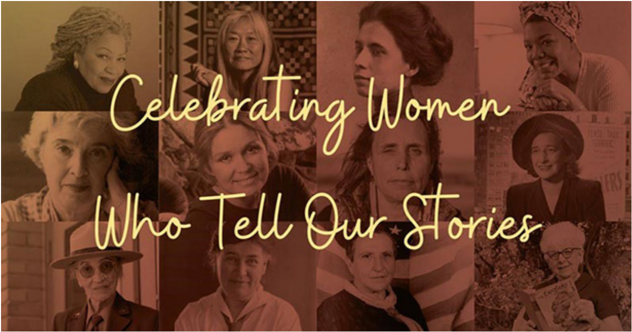
In March, NOC is celebrating Women's History Month. Pictured: Top: Toni Morrison, Maxine Hong Kingston, Jovita Idar, Maya Angelou. Middle: Gerda Lerner, Gloria Steinem, Winona La Duke, Lillian Hellman. Bottom: Betty Soskin, Willa Cather, Gertrude Stein, Marjory Stoneman Douglas