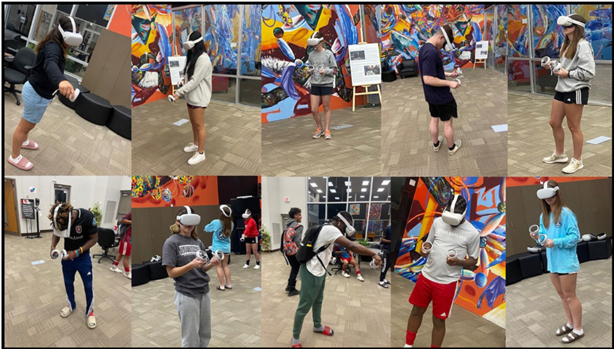
This past week, NOC Tonkawa students sampled the VR headsets in the CEC. The VR headsets are used for career exploration, but students explored various options such as fire extinguisher safety, electrical safety, how to change the oil in a car.