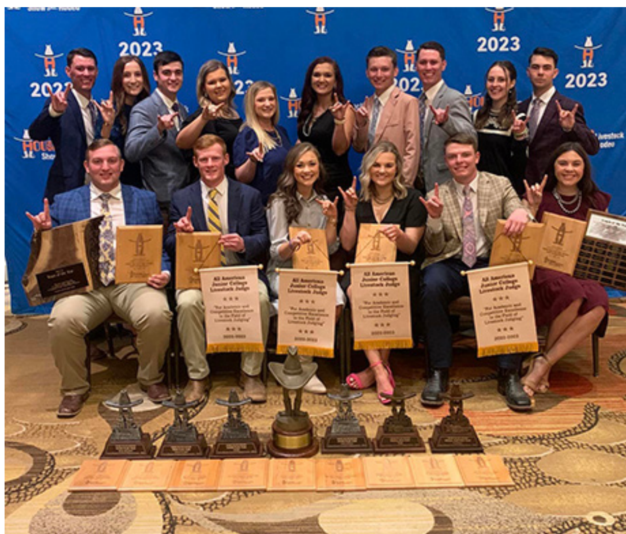
The 2022-23 NOC Livestock Judging Team