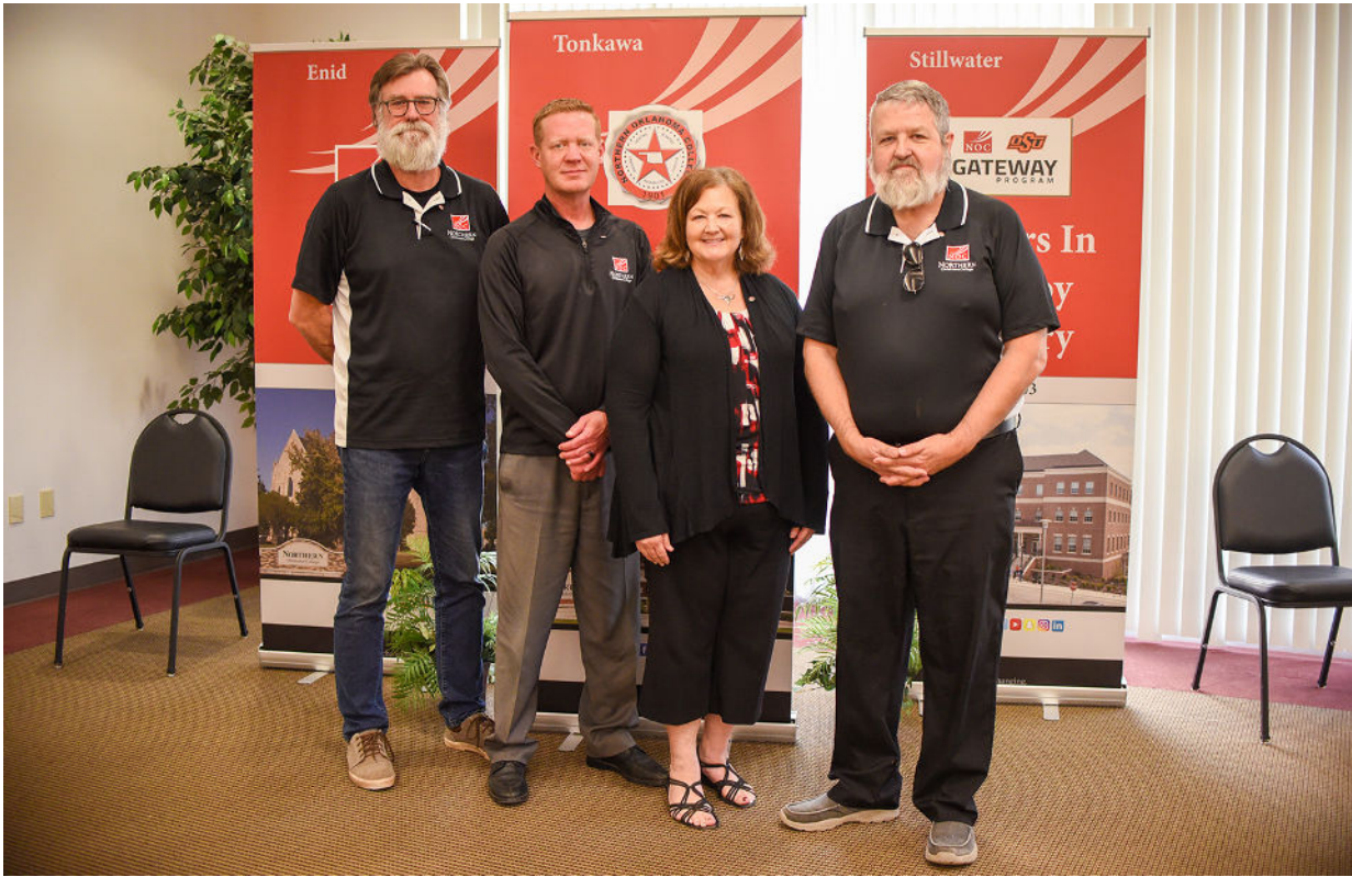
25-Year Service Pins