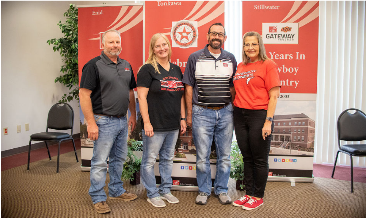
15-Year Service Pins