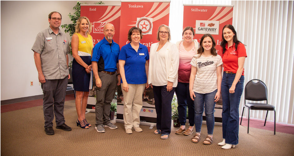
1-Year Service Pins