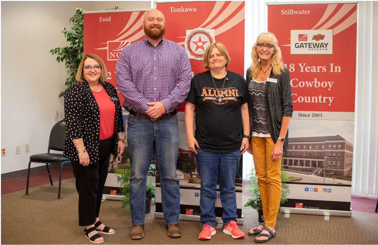
5-Year Service Pins