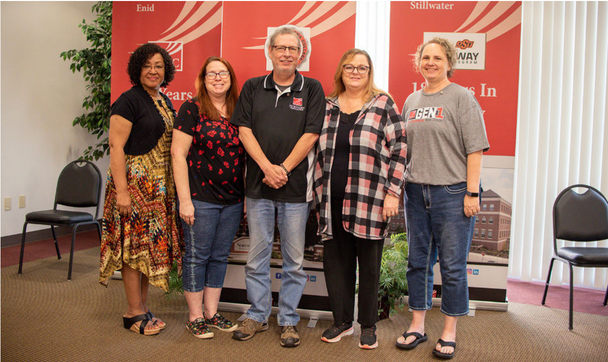
10-Year Service Pins