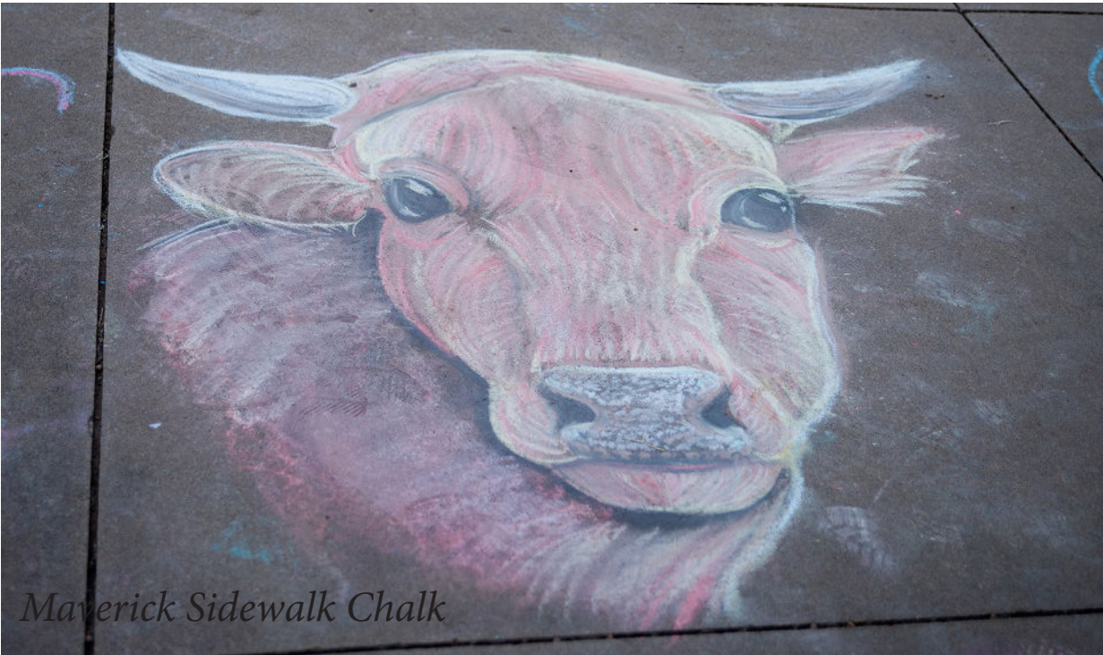
Maverick Sidewalk Chalk