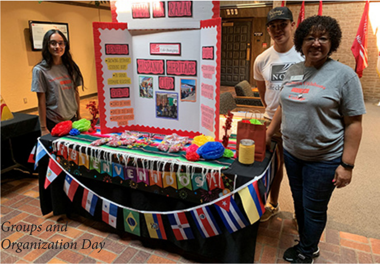
Groups and Organization Day