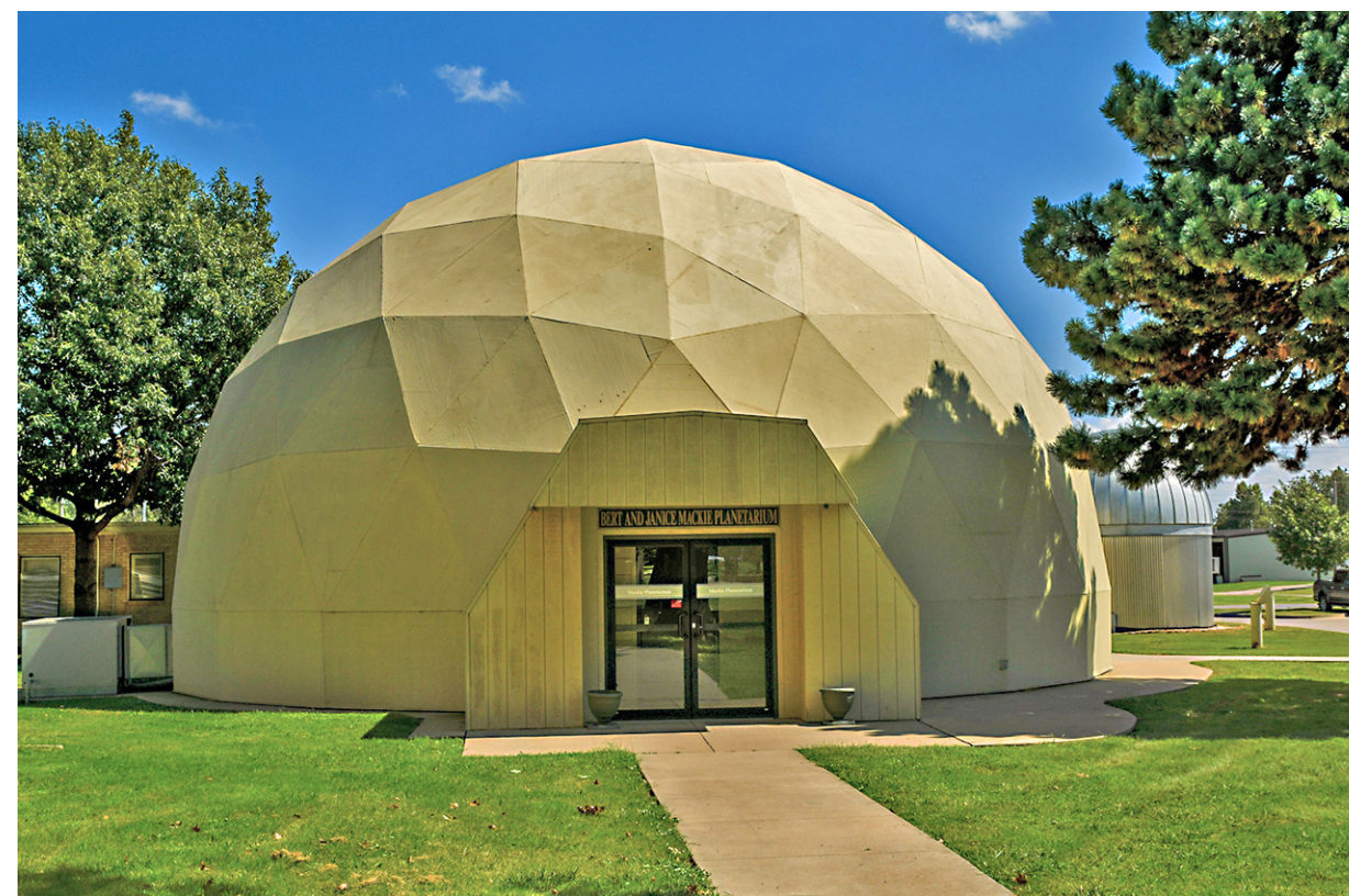
NOC Enid Mackie Planetarium