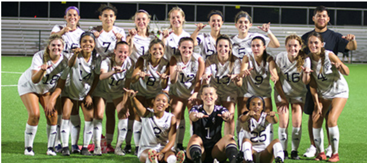
NOC Enid Women after 4-0 win over Redlands Sunday night in programs' first win