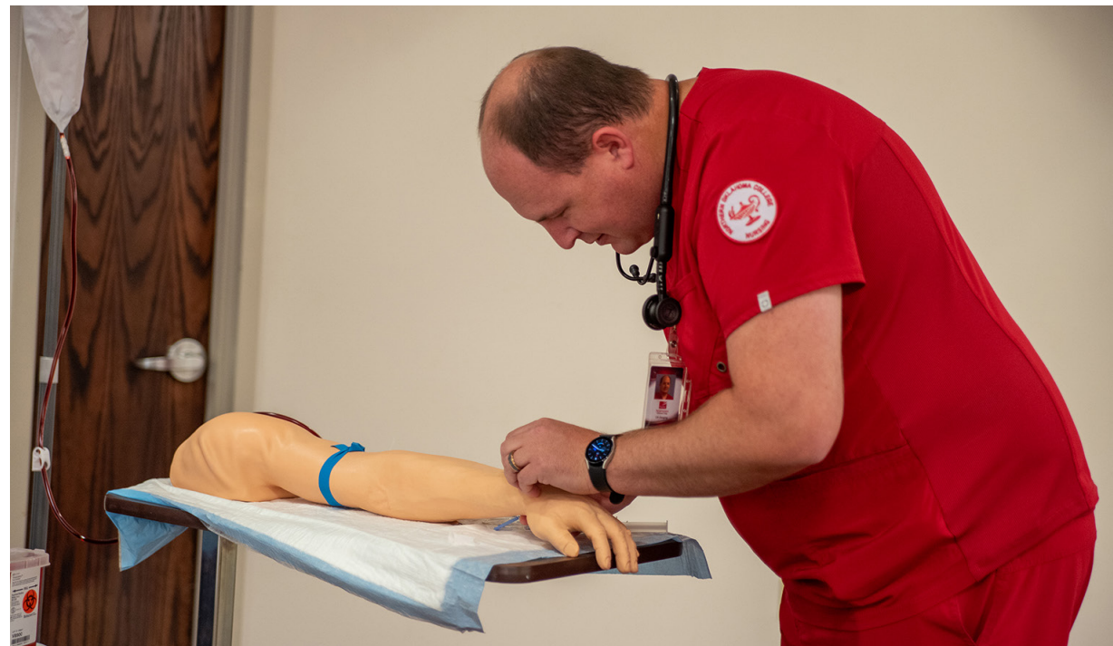
NOC nursing students participated in a Skills Lab Fridaya at the Renfro Center in Tonkawa.

Thirty-five students from all three NOC campuses participated in the 2nd annual professional workshop on the Tonkawa campus. The students came from nursing, pre-engineering and others providing networking opportunities. During breakout sessions students got the opportunity to talk with representatives from transfer institutions, industry representatives, and alumni. This workshop is designed to help develop critical work skills, resumes, and find internship opportunities.