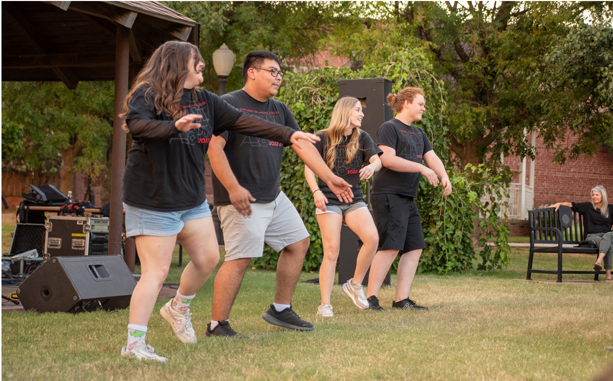
NOC Roustabouts and Roustabout Alums participated in a Full Moon Concert Thursday night in Tonkawa sponsored by the NOC Foundation and Alumni & Community Relations.