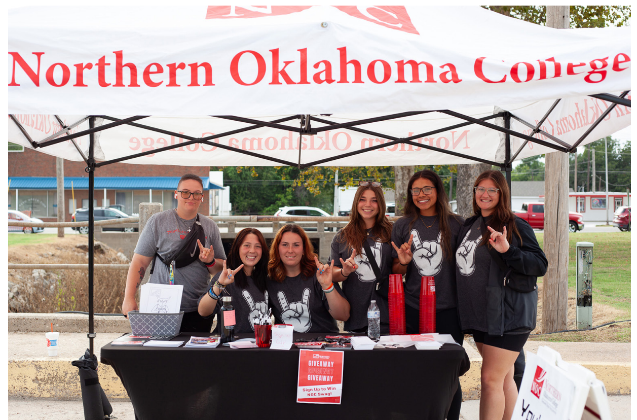
NOC Maverick Softball at the Kay County Fair in Blackwell last week.

Snacks provided but bring your own drink!