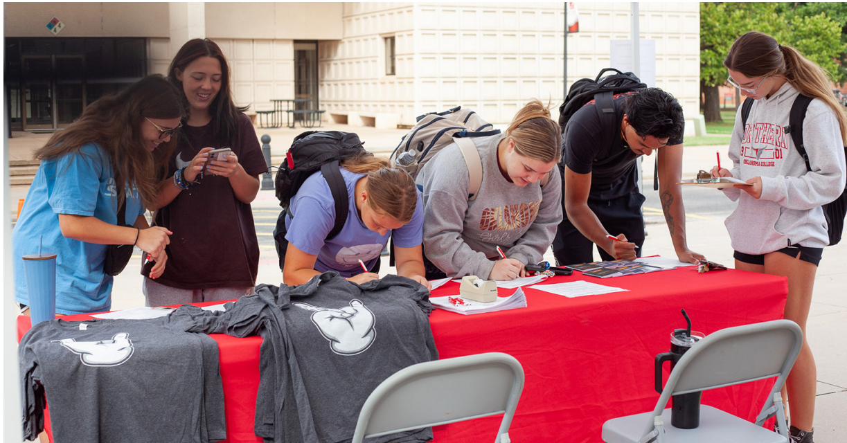
NOC students registered to vote last Friday as part of Constitution Day activities, sponsored by NOC Resident Life.