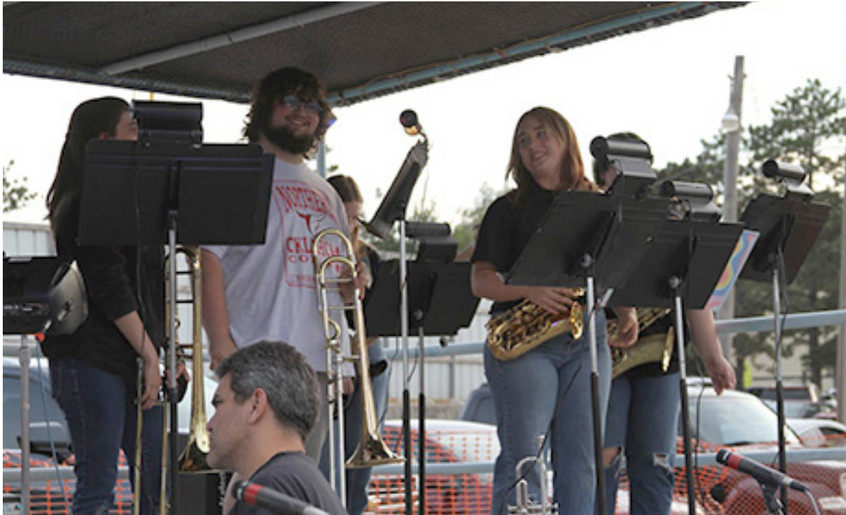
The NOC Roustabouts performed at the Kay County Fair last Tuesday night in Blackwell. The NOC group performed an hour set.