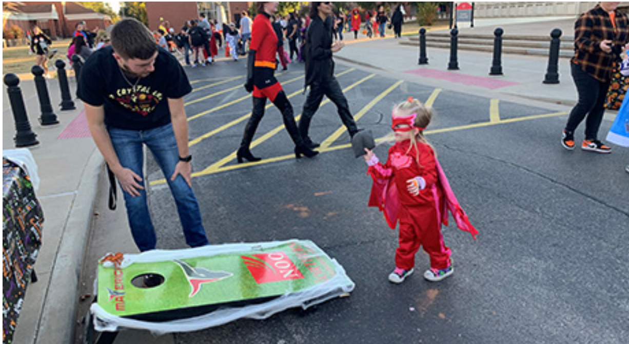
A scene from the 2022 NOC Trick-or-Treat Fair.