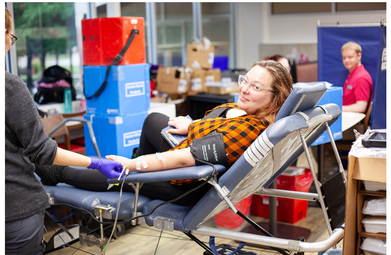
NOC faculty, staff, and students participated in the OBI Blood Drive Oct. 4 at NOC. More photos on Page 5.

Next time you see a blood drive happening soon, pop on in and donate, you will help save a life.