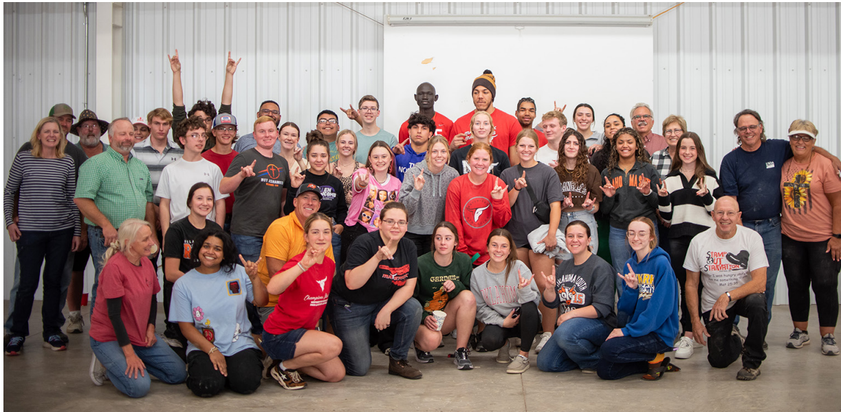
NOC Faculty, staff, and students packaged meals at Stamp Out Starvation Sunday afternoon at the First United Methodist Church in Tonkawa