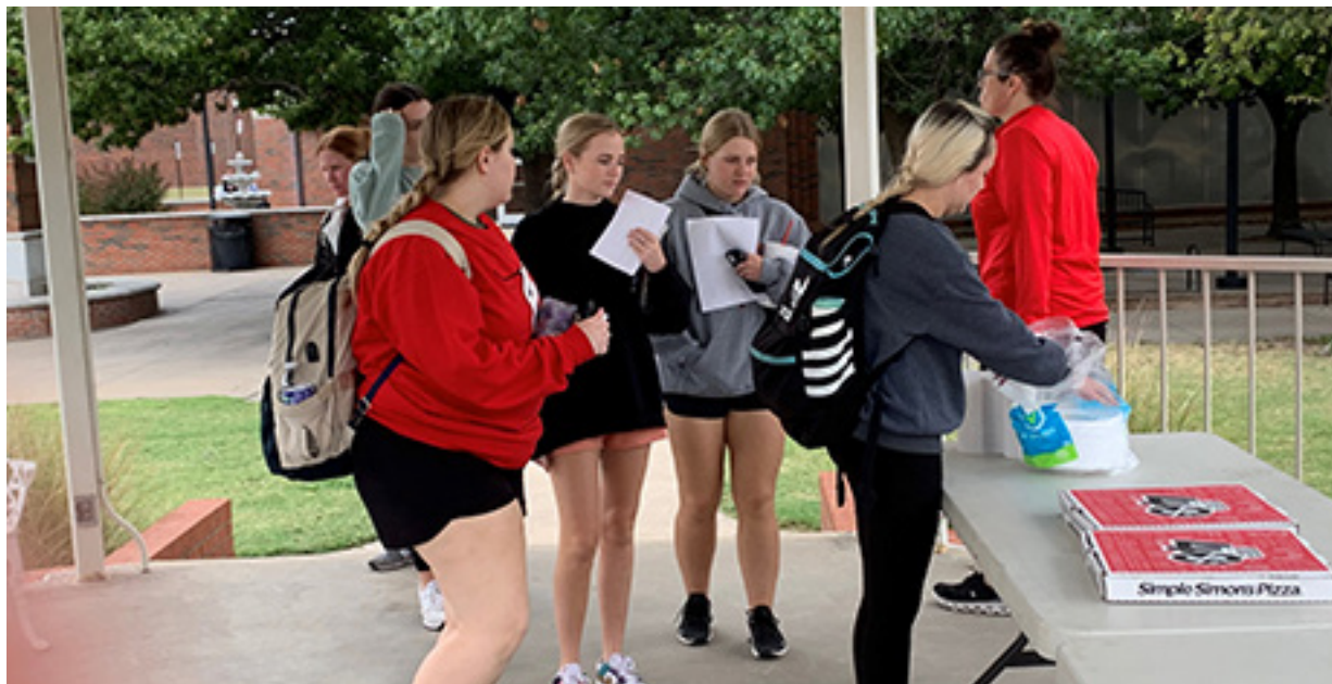
NOC Tonkawa Students enjoyed Picnic with the President on Thursday at the Gazebo. The event was sponsored by Resident Student Life.