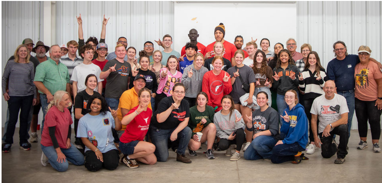
NOC Students assisted with Stamp Out Starvation last Sunday in Tonkawa.