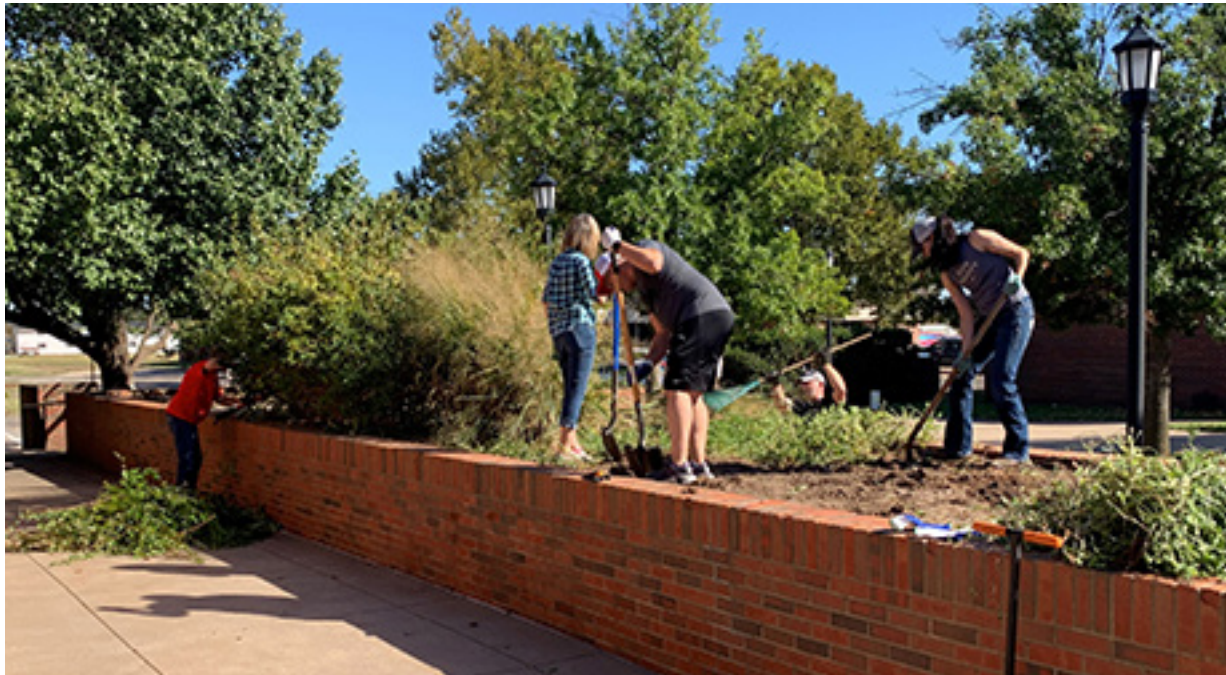
The NOC Tonkawa Beautification Committee sponsored flower bed clean-up workdays Tuesday and Wednesday working at the Student Union, Central Hall, and Creative Arts.