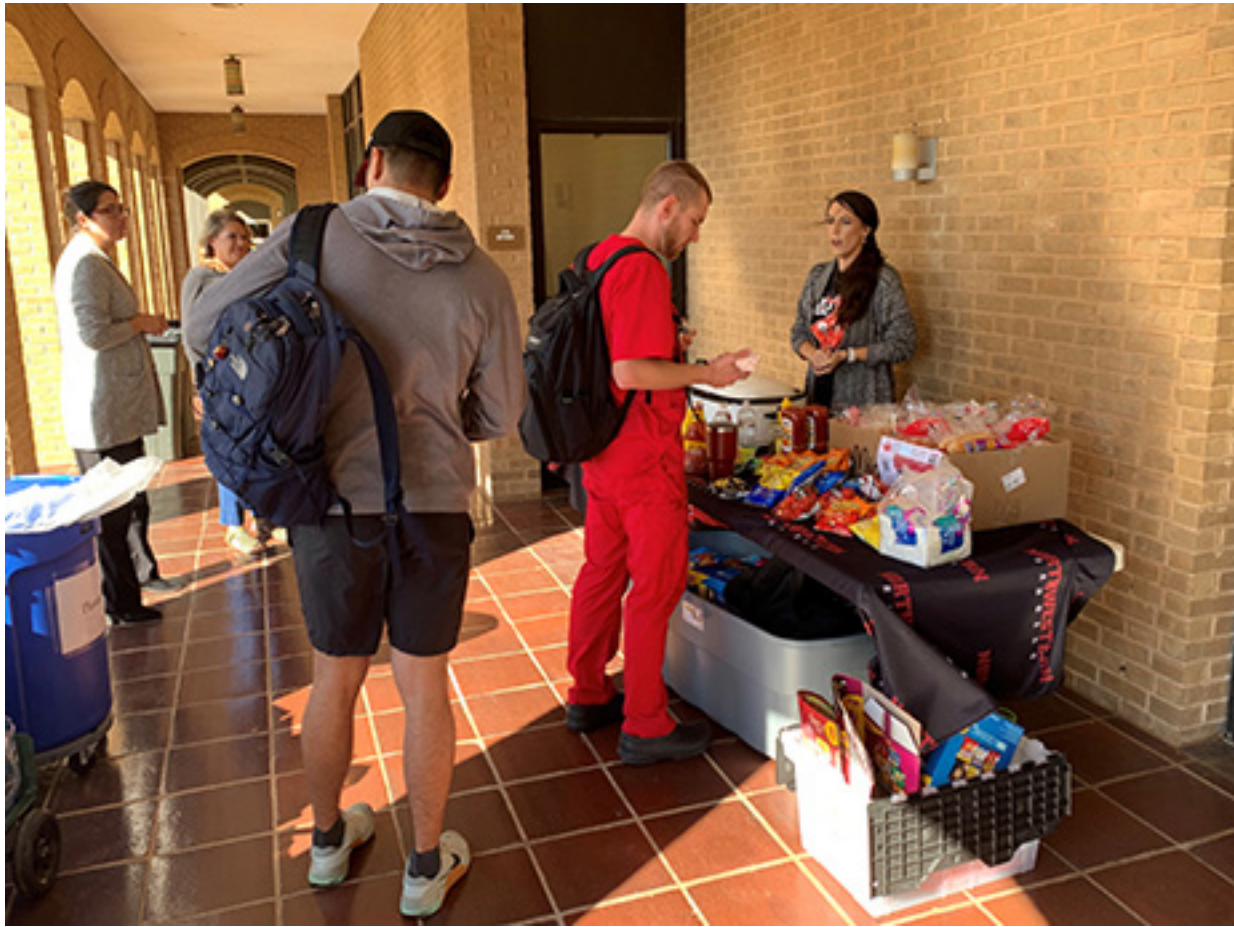
NWOSU hosted NOC Enid students Thursday at the Bridge BBQ where students could learn about the Bridge Program partnership with NWOSU-Enid.