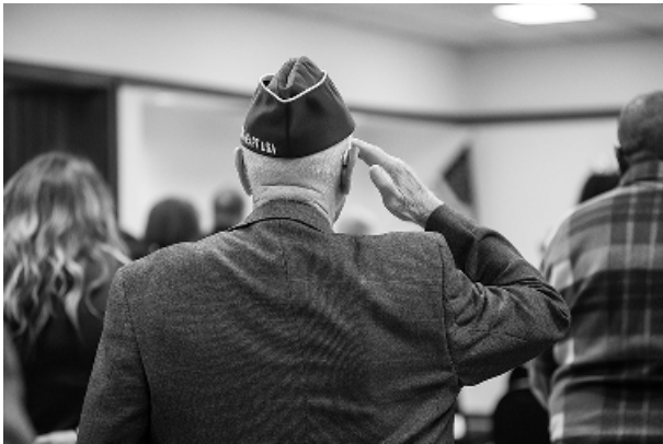
An Enid area veteran salutes the flag at Thursday's program at NOC Enid.