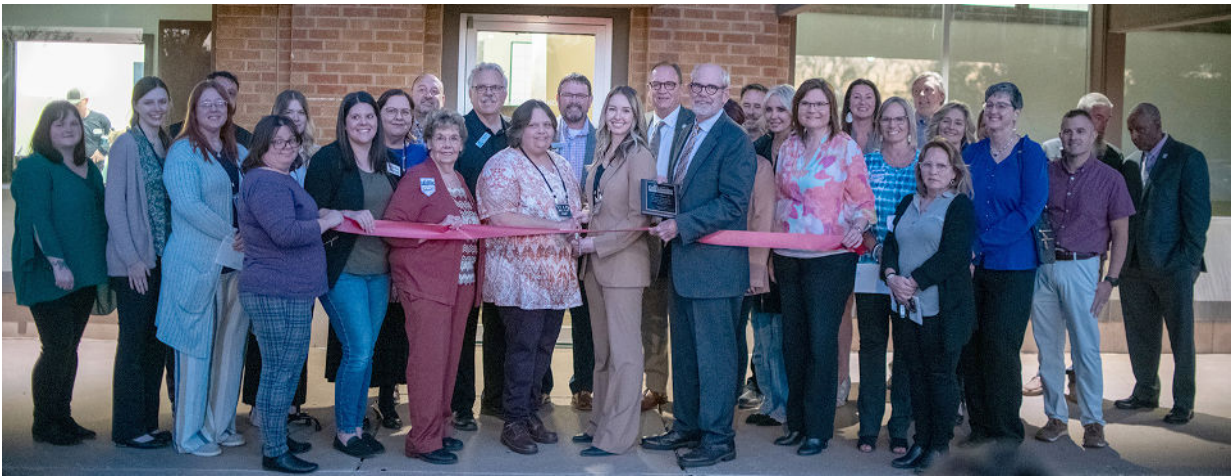
Making A Difference Ribbon Cutting at NOC Enid last Tuesday. The non-profit organization is utilizing space at the NOC Enid campus for counseling services for the Enid community.