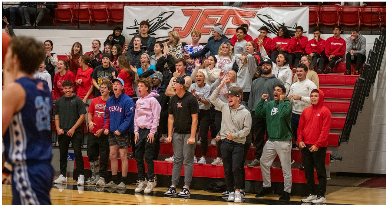
Jets Student Section