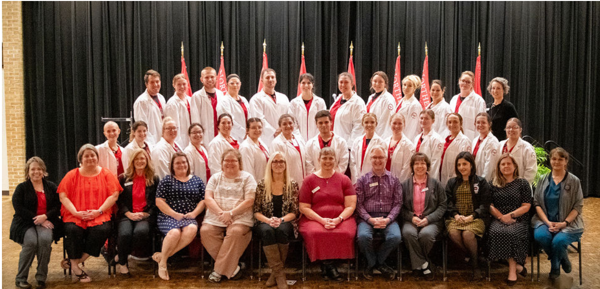
NOC nursing students and nursing faculty participated in a White Coat ceremony at NOC Enid on Nov. 7.