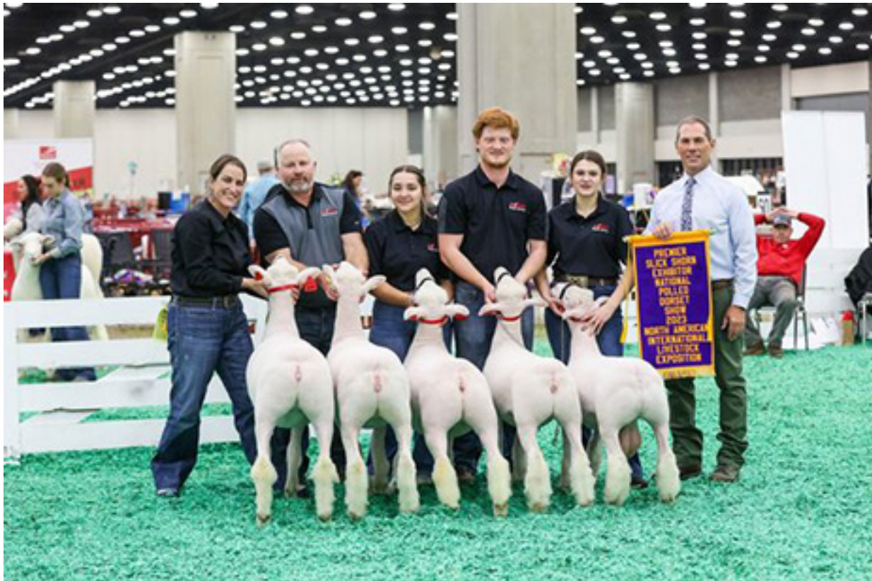
NOC Students at the NAILE Sheep Show in Louisville, Kentucky