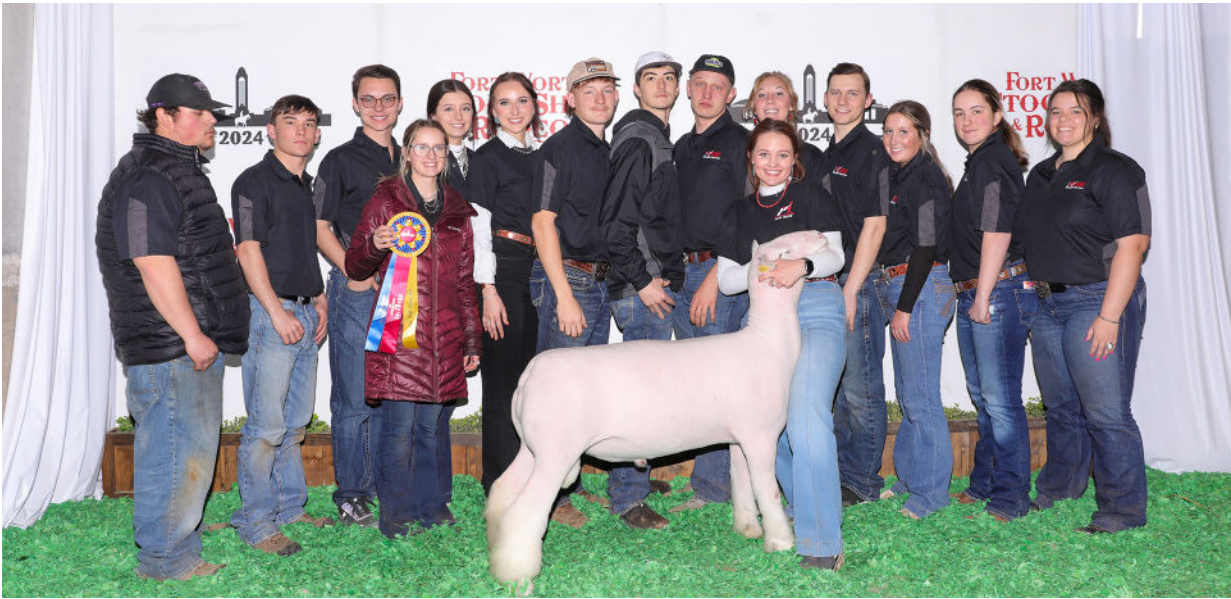
NOC Sheep Center with the Champion Ram at the Ft. Worth Show.