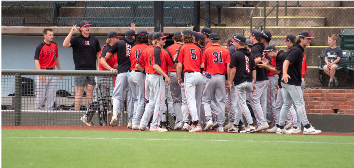
NOC Enid Jets Baseball