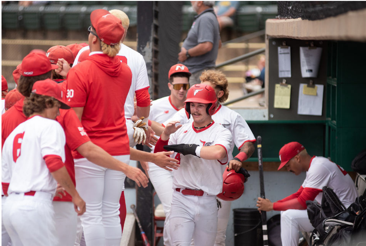
NOC Tonkawa Mavs Baseball