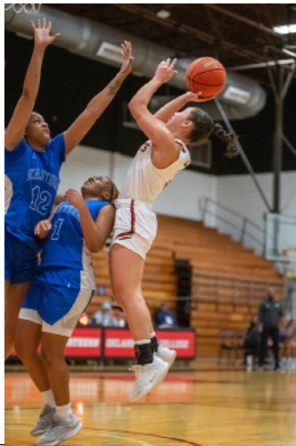
The NOC Enid Lady Jets (11-7) and Jets (9-15) travel to Western Thursday for conference games starting at 5:30 p.m. The Jets are at home Feb. 22 against Murray State.