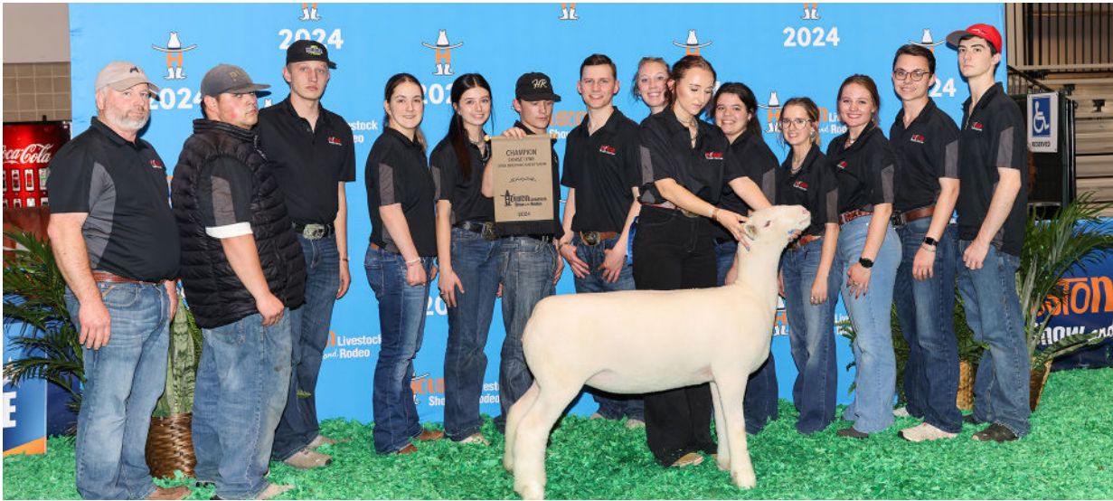
NOC showed the Champion Ewe at the Houston Show Feb, 25-28