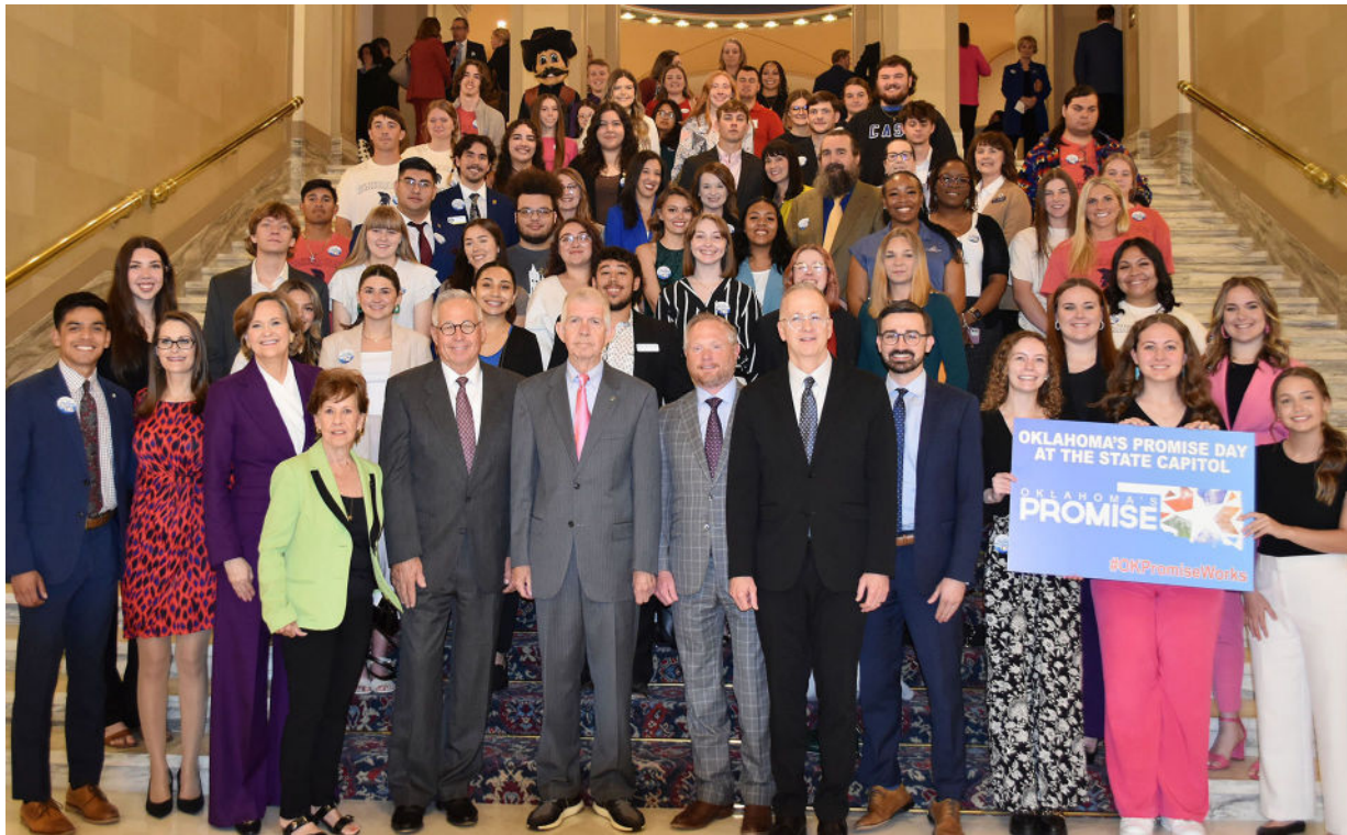
Oklahoma Promise Day at the Capitol on Thursday, April 11.