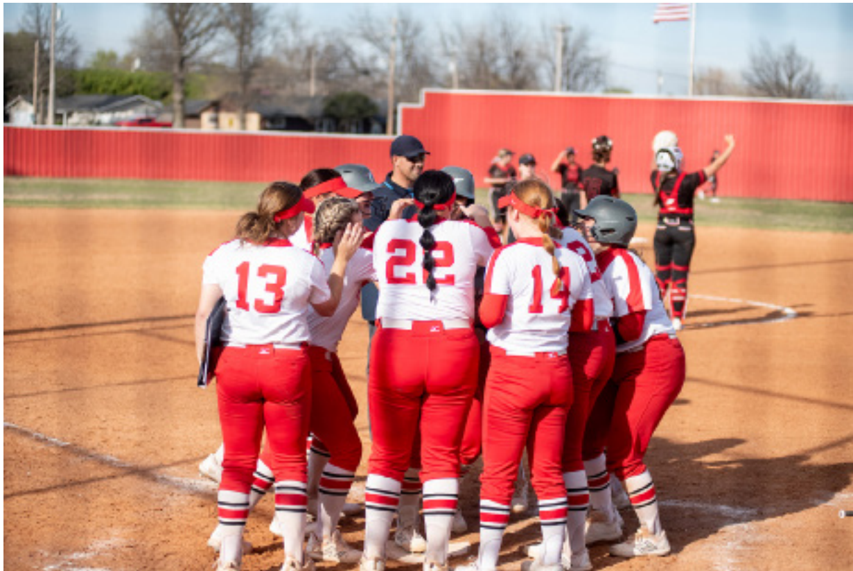
Mavs softball has a team meeting during their games against NOC Enid. The Mavs host Pratt (KS) on April 30 in the final home games of the season.