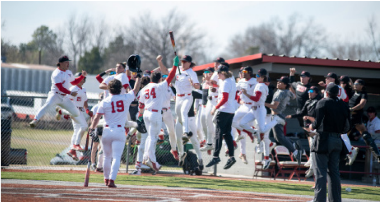
The NOC Mavs celebrate a 15-10 win over NOC Enid during the first round of Bedlam games. The Mavs face the Jets again on May 3 for a conference doubleheader.