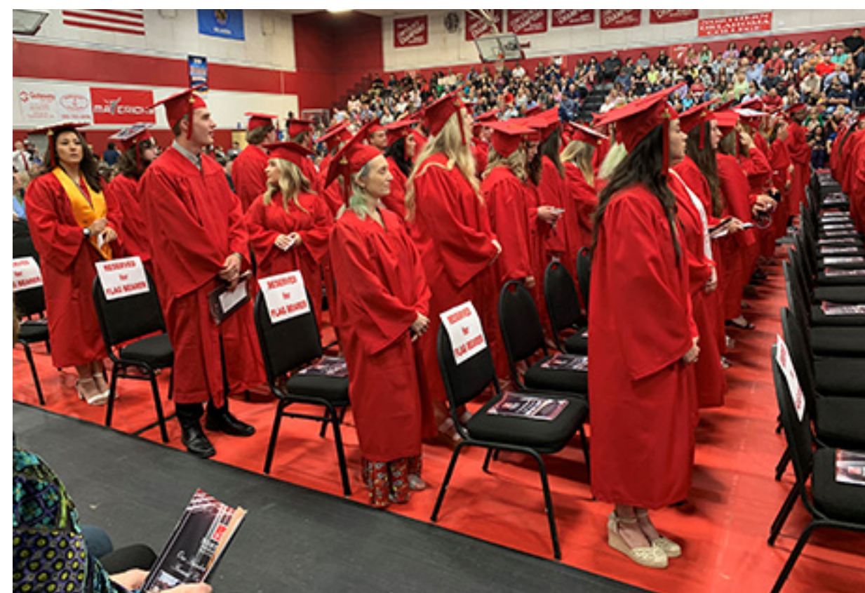
NOC students went through commencement exercises on May 4.

"Whatever your next step is, where attending