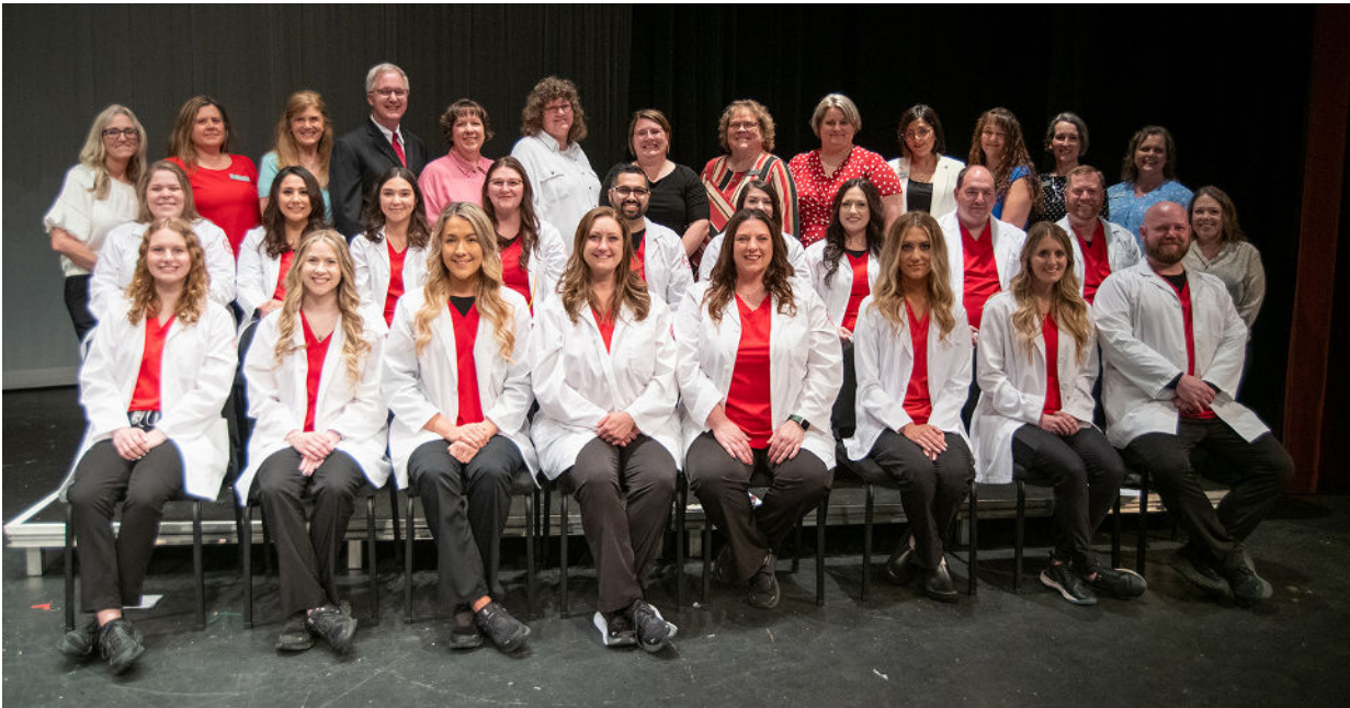
NOC Nursing graduates and faculty at the NOC Nurses Pinning Ceremony May 3 at NOC Tonkawa.