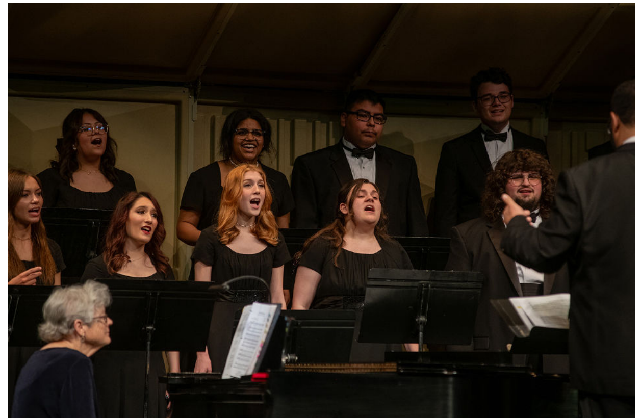
NOC Fine Arts held the annual spring concert Sunday at the Kinzer Performing Arts Center.