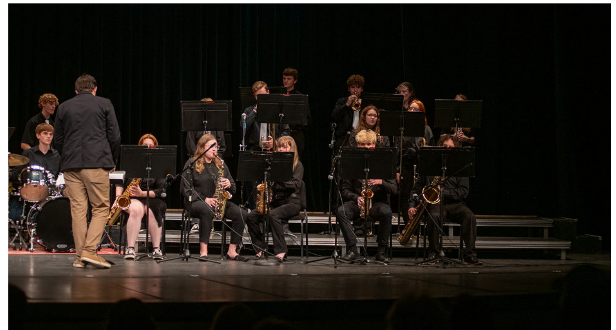
NOC held the annual Red Bud Jazz Festival Tuesday night with assistance from the Perry and Blackwell High School bands.