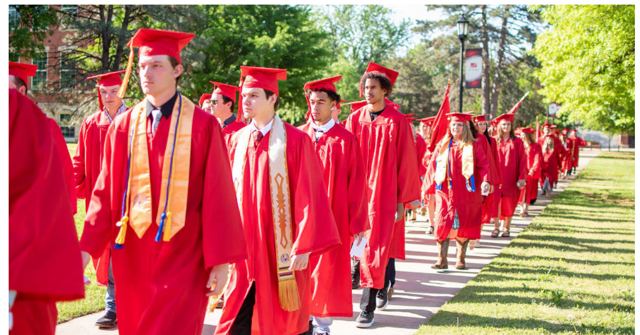
NOC Tonkawa students march for the 2022-23 graduation ceremony. This year’s graduation is Saturday, May 4, at 9:30 a.m.