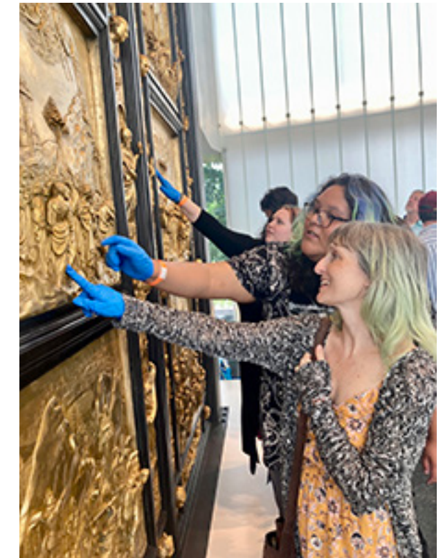
NOC art students toured two art exhibits in Kansas City in May. (photos provided)