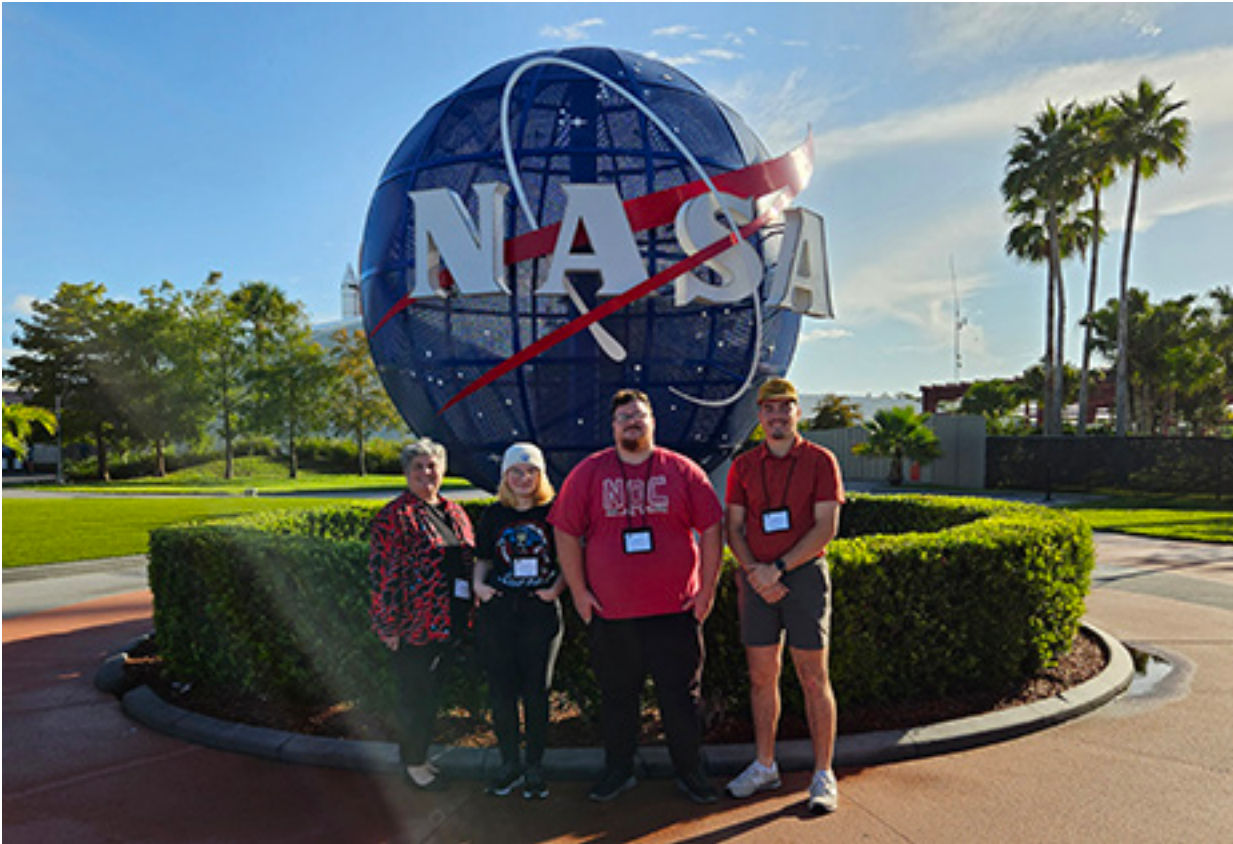
Three NOC preengineering students who were part of NOC’s Rocket Team last spring toured the NASA facility in Cape Canaveral, Florida in early September.