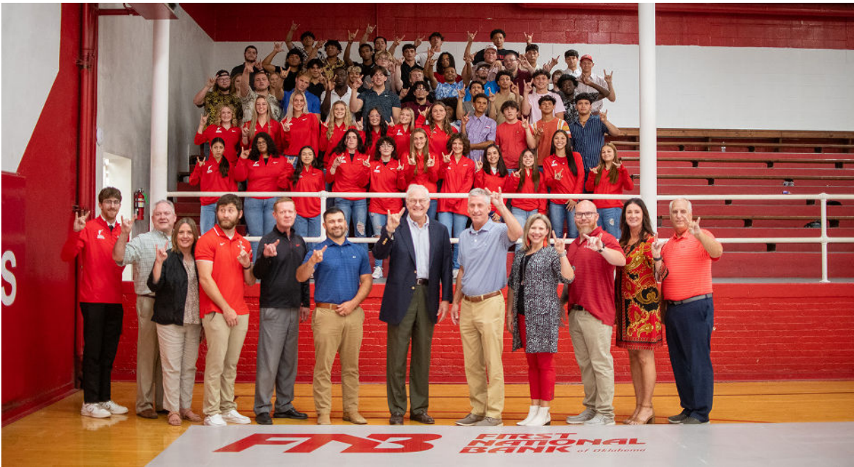
First National Bank of Oklahoma donated two new mats for the NOC wrestling programs. Bank officers and NOC administration are pictured with members of the men's and women's wrestling programs.