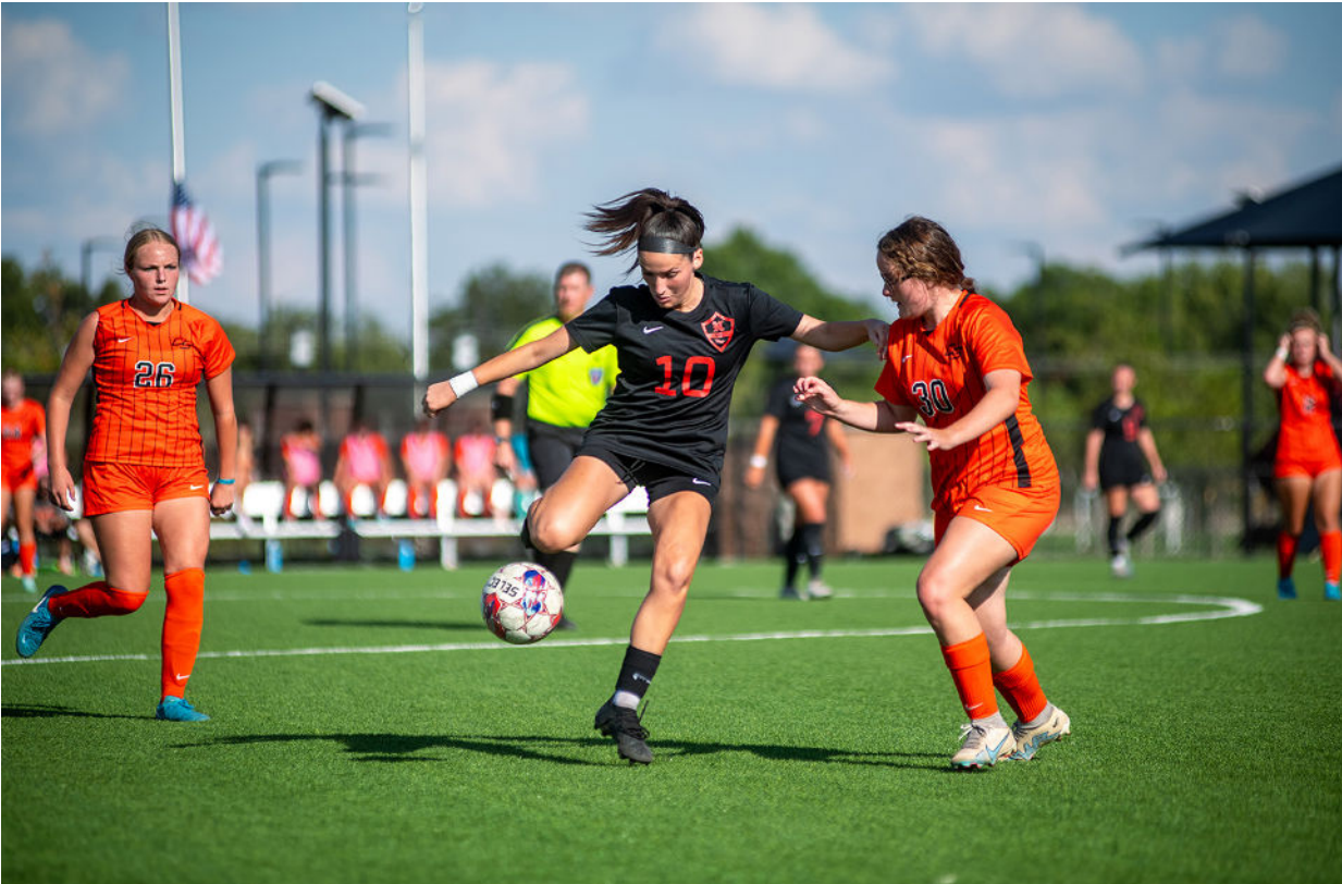
Jets Women's Soccer is 2-1-2 on the season, their next home game is Wednesday, Sept. 18 against Rich Mountain (AR) at 5 p.m.