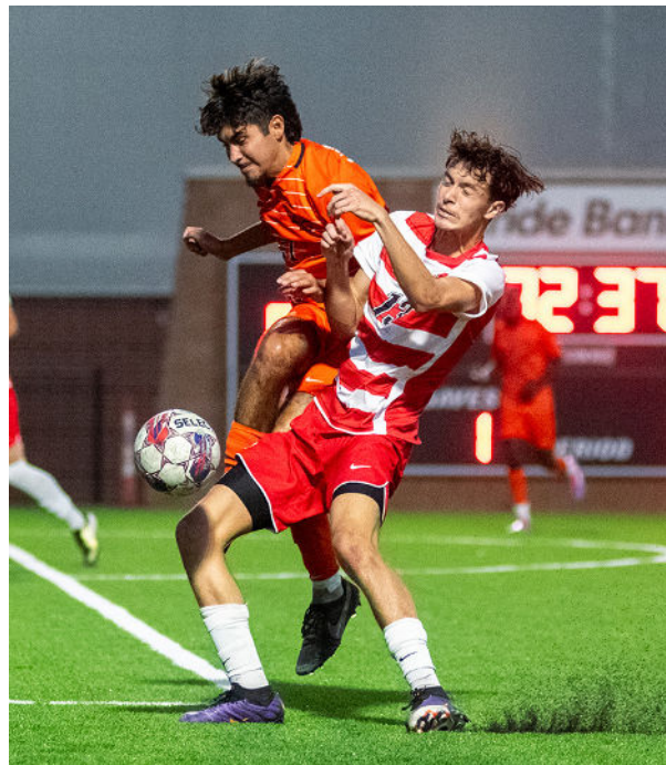
Jets Soccer is 3-3 on the season, the Jets host Rich Mountain (AR) on Wednesday, Sept. 18 in their next home game.