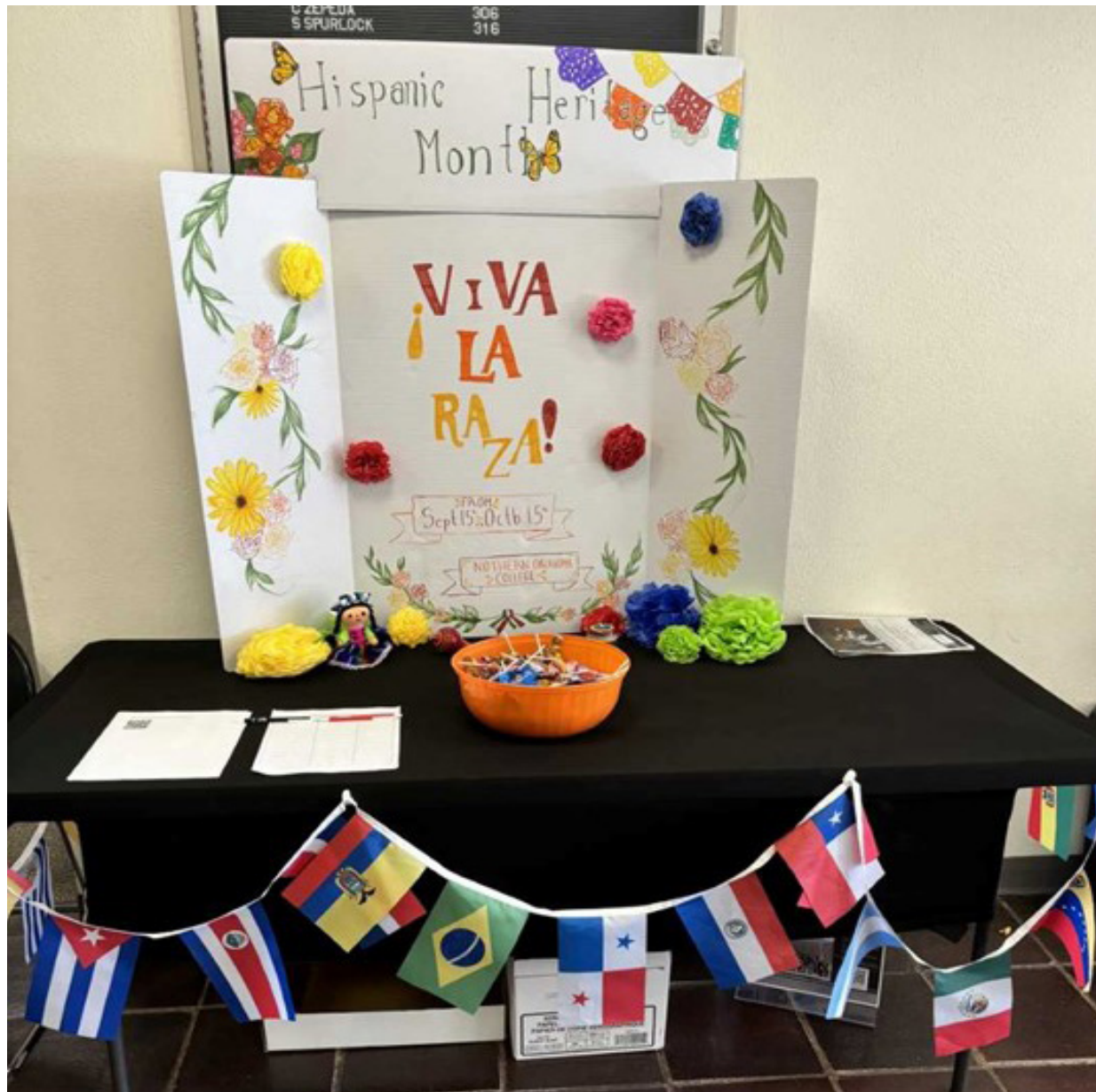
Viva La Raza