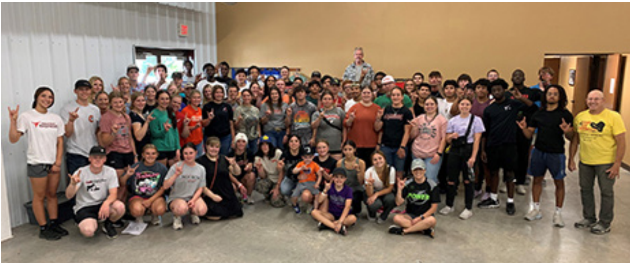
NOC Tonkawa students participated in the Stamp Out Starvation last Sunday.