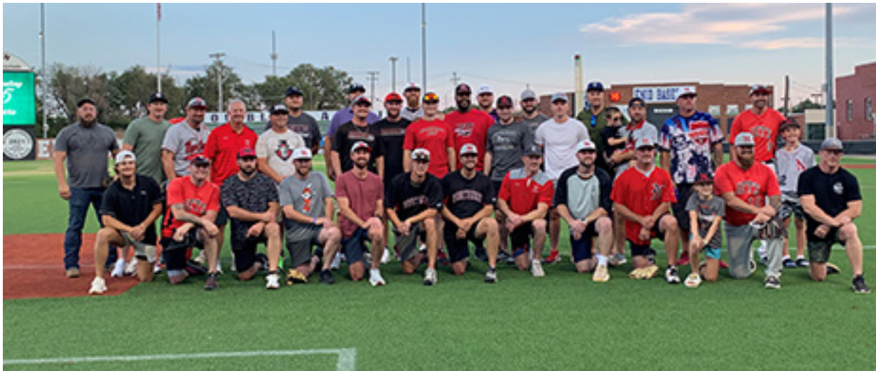
NOC Enid baseball alums played Saturday night at David Allen Memorial Ballpark Saturday night.